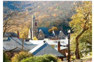
Jim Thorpe Town