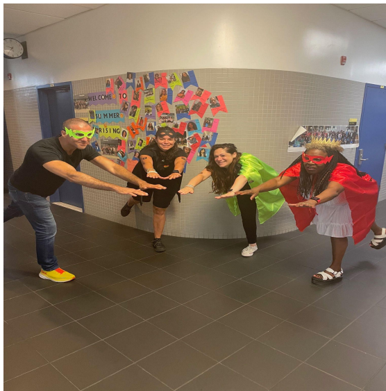
P.S. 130 Superhero/ Character Day