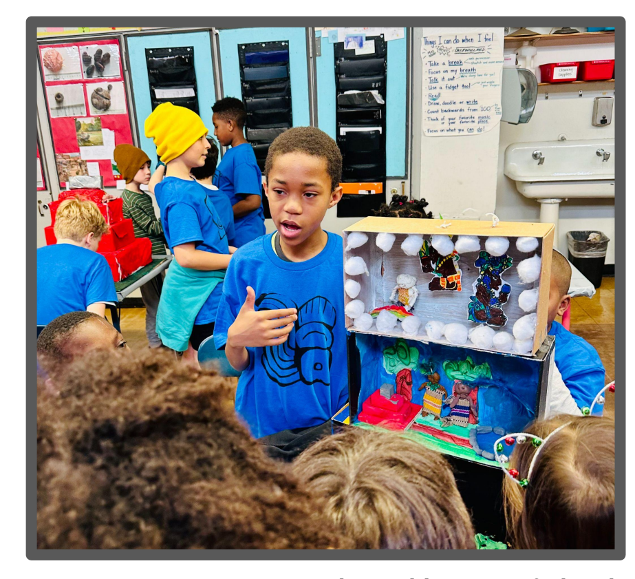
PBL at Brooklyn New School