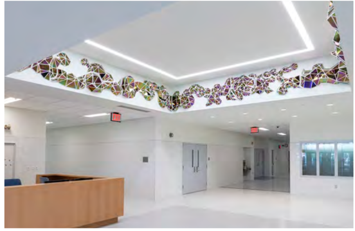
East New York Family Academy, Brooklyn Graham Caldwell, Polychromatic Landscape , 2021