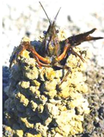
Crawfish mound. Found in the wetlands of the early prairie.

Up through the mid-nineteenth century, the unexpected, hidden wetlands caused an exaggerated fear of the prairie as a dangerous place to be avoided. The fear was overstated, 8 but the location of these unpleasant places was difficult to detect in the prairie-grass sea. Charles Dickens, while traveling in the prairie area in 1842, realized that prairie promoters had misled the public. To balance the account, he wrote a “lurid description” of the land. He called the land around Cairo, Illinois as “a hotbed of disease, an ugly sepulcher, a grave un-cheered by any gleam of promise....” 9 The wetlands were not as widespread as some feared; but, those who blundered into the wetlands found their horses mired in muck. In time, prairie travelers left traces in the grass to guide others around the swamps.