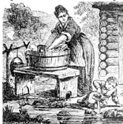
Drawing from Kristina Blatchford, “Pioneer Women on the Illinois Frontier,” Illinois History , December 1992. The ague or malaria severely limited women’s work—a wide variety of unending chores—causing hardship for the whole family.

The wetlands were not just inconvenient; they also brought disease. Because malaria, or the dreaded shaking disease they called “ague,” sprung from the wetlands, the prairie earned a reputation for being dangerous and unhealthy. 11 Sickness was common among the new arrivals. A noxious gas called “miasma” emerged from deteriorating plants in the wetlands. Many blamed the gas for the flu-like or malarial symptoms that sapped the strength of whole families. The sickness prevented families from being properly prepared for fall and winter. “Pioneers joked that newcomers weren’t really settled until they had suffered their first case of swamp flu.” 12 Writing in 1900, John Gresham said, “To have a severe case of malarial fever or several season’s run of the ague was expected by each new-comer, and none were considered as having been fully inducted into all the mysteries of citizenship until they had had the regular malarial experience.” 13