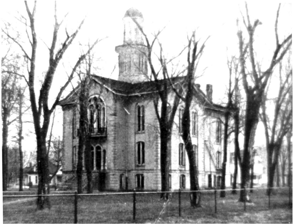
Old Douglas County Court House.

“Review of Tuscola’s Past,” The Tuscola Journal , Sesquicentennial Edition June 26, 2007 http://thetuscolareview.com/wp-content/uploads/2013/03/courthouse.gif