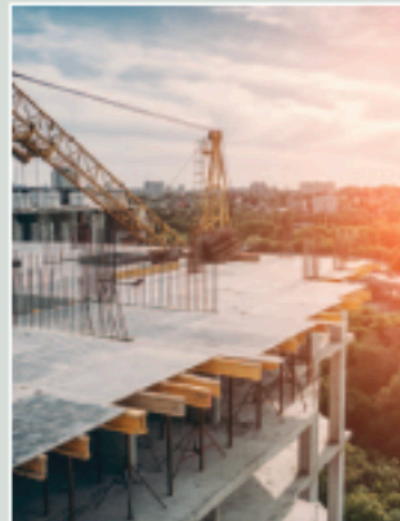
Peter supports shifting the costs of growth from taxpayers to developers