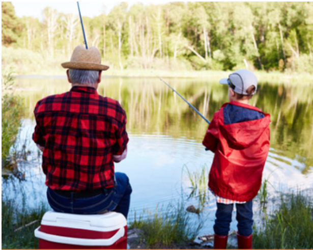
All Church Fishing Trip Coming In August 2025