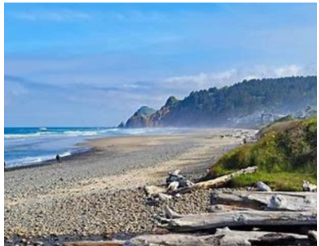
All Church Beach Trip Coming In August 2025