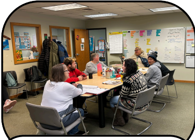
Pictured above: members and staff participating in one of our weekly employment meetings

Employment is one of the main pillars of the Clubhouse model. Every week we have an Employment Readiness meeting where members can make action plans and steps toward their individual employment goals.