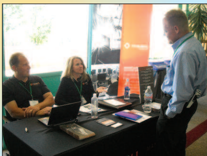
Strategic Partner ToolingU exhibit.