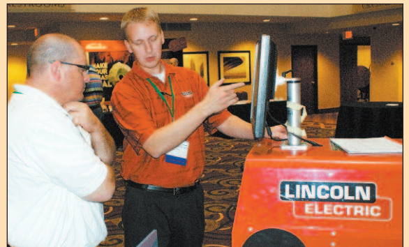
Lincoln Electric demo.