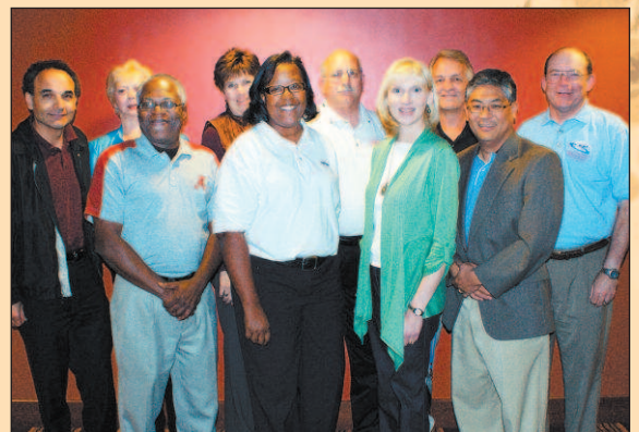
NCATC Board at the Milwaukee Conference