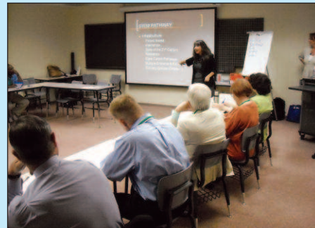
Workshop attendees engage in green technology sessions.