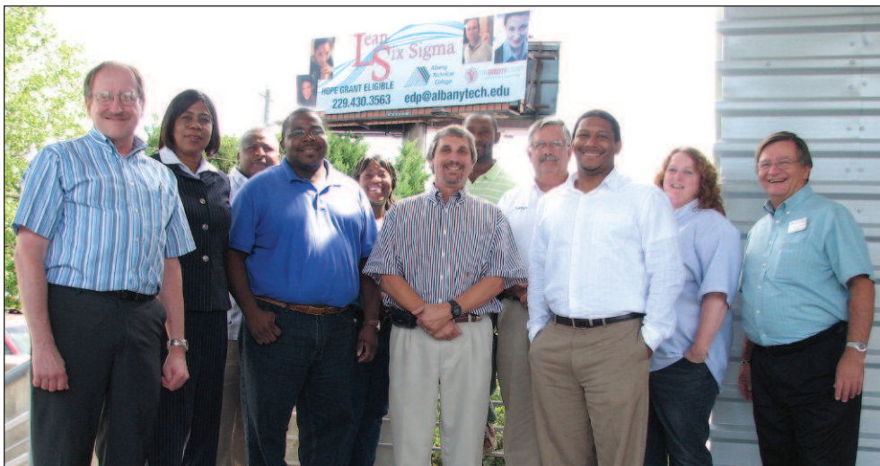
TQG delivers blended e-Learning in Lean, Six Sigma, ISO Internal Auditing, Healthcare Quality, Basic Statistics, Problem Solving, Logistics (via TQG's partnership MSSC),