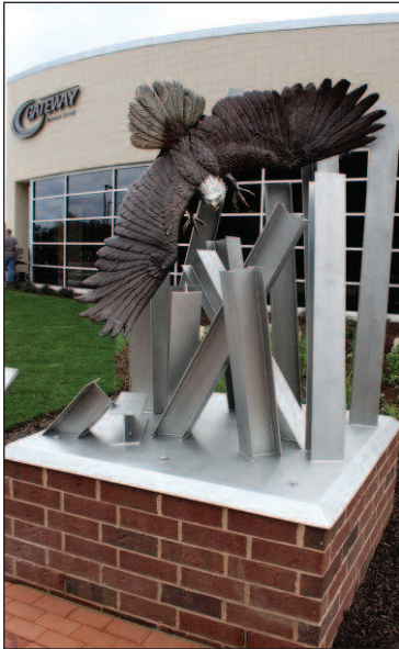
The ceremony featured the dedication of a HERO Center monument, "On Eagles Wings," paying tribute to emergency workers. The monument includes a piece of the World Trade Center pulled from the wreckage caused by the terrorist attacks of Sept. 11, 2001.

G ateway Technical College (WI) held a community grand opening ceremony on September 3, 2010 of its new Health and Emergency Response Occupations (HERO) Center, a state-of-the-art facility which will provide added opportunities for EMS students and firefighters to receive realistic, hands-on training.