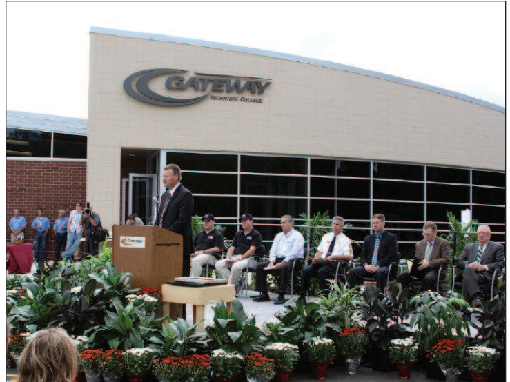
The $1.5 million, 12,000-square-foot addition and remodeling to the facility is located at 380 McCanna Parkway near Gateway's Burlington Center.