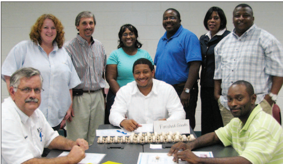
WinAt-Work®, TQG's 6-8 hour e-Learning Series consisting of four modules - Interviewing, Good Work Habits, Getting Along, and Getting Ahead - features dozens of actors and hundreds of video scenarios requiring non-stop learner interaction.