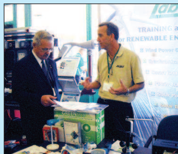
Strategic Partner Lab Volt exhibit.