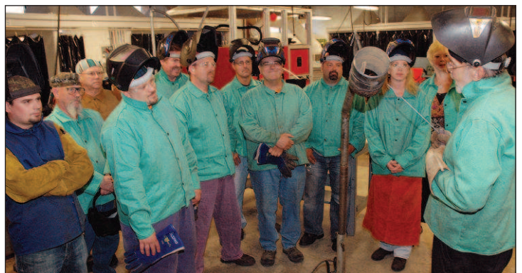
The Weld-Ed center provides education that is driven by industry needs through a network of regional partners.

LCCC is also home to the Materials Joining Institute that provides customized training for industry as well as non-credit and credit certificates and associate degrees for new students and those in need of skills updates.