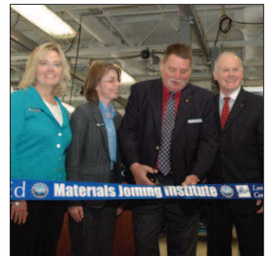
The 4,000 square-foot center, doing business as Weld-Ed, was recently renovated with support from a $4.9 million grant from the National Science Foundation.

Located in the Nord Advanced Technologies Center at LCCC the Weld-Ed portion of the facility has been redesigned to include state-of-the-art welding lab facilities, new classrooms and offices ~ see WELDING page 6