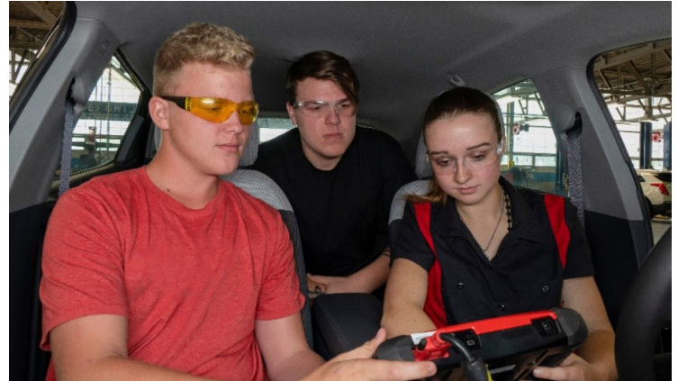
Macomb Community College students diagnosing vehicle systems