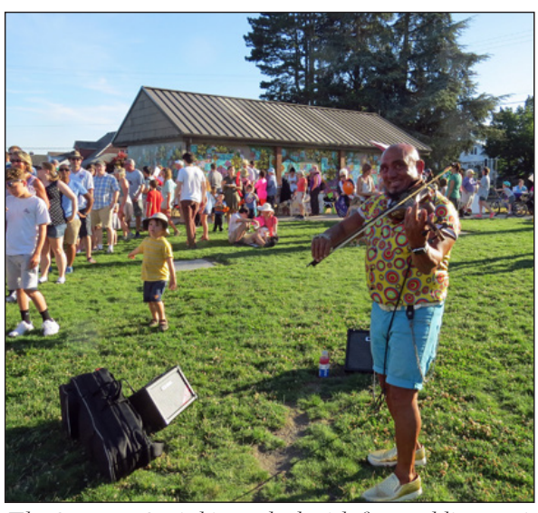
The Summer Social is packed with fun and live music.

We hope you can join us for a funfilled evening with your neighbors. The Summer Social is always a fun, enjoyable event and this year will be no exception. It's a great opportunity to socialize with your neighbors – the ones you know and ones you have yet to meet! We'll also have tables from over 40 local businesses, schools, organizations, and Seattle city departments who serve the needs of our neighborhood. Come by to meet the people behind these names and learn more about their resources, services, and goods!