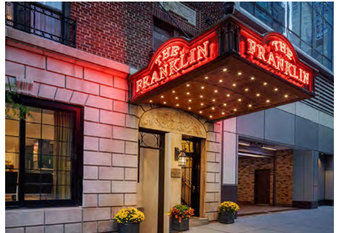
The Franklin New York 164 East 87th Street, New York, New York 10128