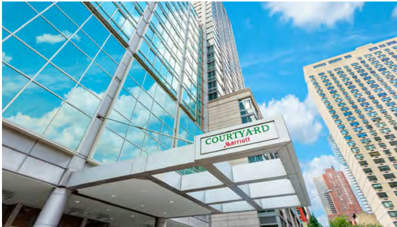
Courtyard Marriott New York Manhattan / Upper East Side 410 E 92nd St, New York, New York 10128

Please note that room reservations should be made in advance. Below are a few suggested hotels close to the hospital.