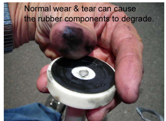
Normal wear & tear can cause the rubber components to degrade.

An RP is composed of two check valves and a relief valve, which incorporate a variety of rubber parts, plastic parts, springs, diaphragms, o-rings, and so forth. These parts can wear out from normal wear and tear, be degraded by the water and substances found in the water or be damaged by debris in the water, such as rust, rocks, nails, wood, solder, and whatever other substance has found its way into the water supply.