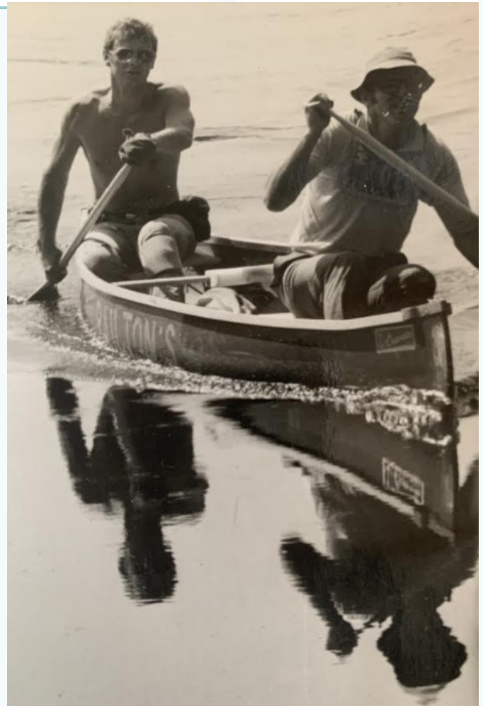
Marathon Paddlers possibly late 1970's'