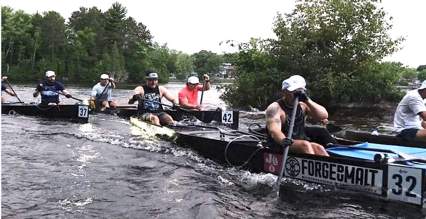
Race course and format for Nationals in Shawinigan was challenging but fun.