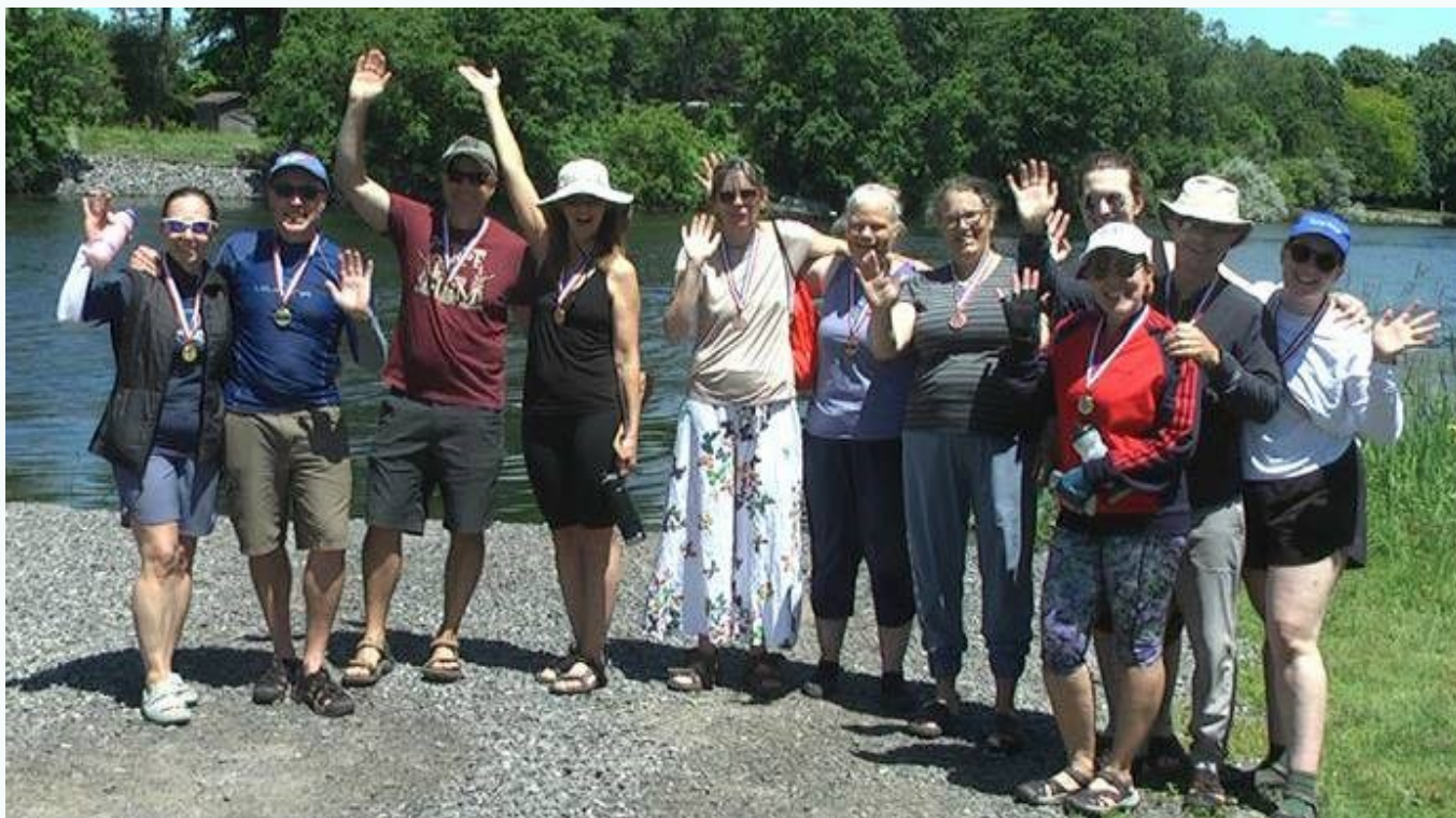
Manotick around the island winners!

2023 Manotick Round the Islands video link