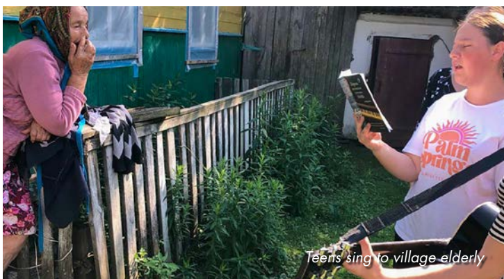
Teens sing to village elderly

Master's Foundation will be at the Bonnyville Pentecostal Church on Sunday December 8th, 2024.