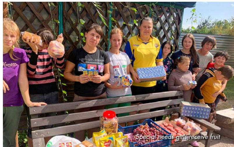
Special needs girls receive fruit