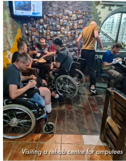
Visiting a rehab centre for amputees

From a ministry leader: After the service, up to 50 displaced people stay for tea and sweets. We take this opportunity to speak with them and pray for their needs. Some of the stories of the people who were forced to move from the war zones are shocking, tearful and desperate. They have lost absolutely everything. One woman is from the Donetsk area. Her only son is missing. Her home was destroyed. We believe that the Lord comforts such people. God cares for Ukraine through MF!