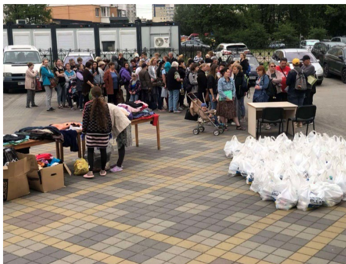
Line up for food and clothing in a western city of Ukraine