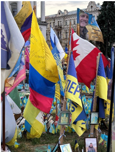
A memorial to the fallen (includes 12 Canadians)