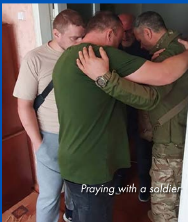
Praying with a soldier