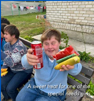
A sweet treat for one of the special needs girls

Receive our news in your inbox! To receive our communications via email, contact us at info@mastersfoundation.org