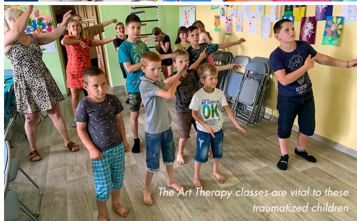
The Art Therapy classes are vital to these traumatized children