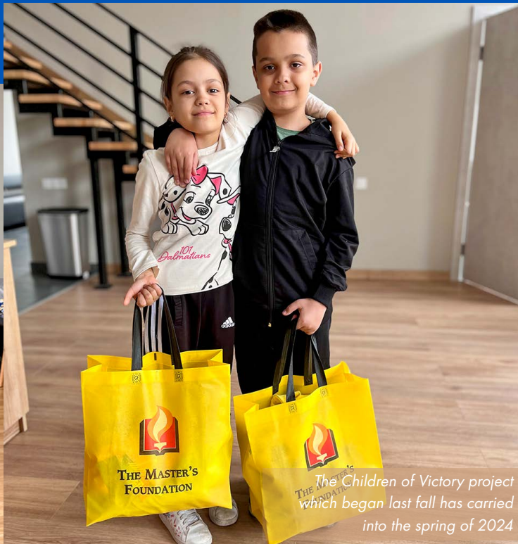
The Children of Victory project which began last fall has carried into the spring of 2024

mountain rivers and waterfalls. It was impossible to calmly take him away from the water. It is so beautiful that a rivulet flows near the base. We went there every day, enjoyed its beauty and soothing noise.”