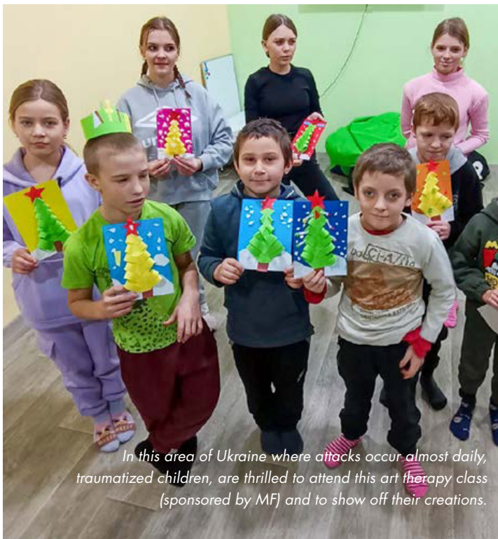
In this area of Ukraine where attacks occur almost daily, traumatized children, are thrilled to attend this art therapy class (sponsored by MF) and to show off their creations.

Your donations have enabled us to send a total of $332,000 worth of aid in 2023. THANK YOU!