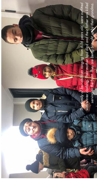
The family of four children ranging from 6-16 years old, were outfitted with winter clothing. Their mother had died and their father was killed serving in the front. They are being brought up by their grandma.

It was imperative for Masters Foundation to address the challenging needs of Ukrainian families and especially to supply and support families having difficulty providing warm clothing for their children. However important these are, our ministry partner took time and personal interest in each family, listening to their history, their pain, their hopes and their concerns.