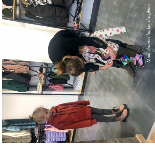
Mom chooses for her daughters