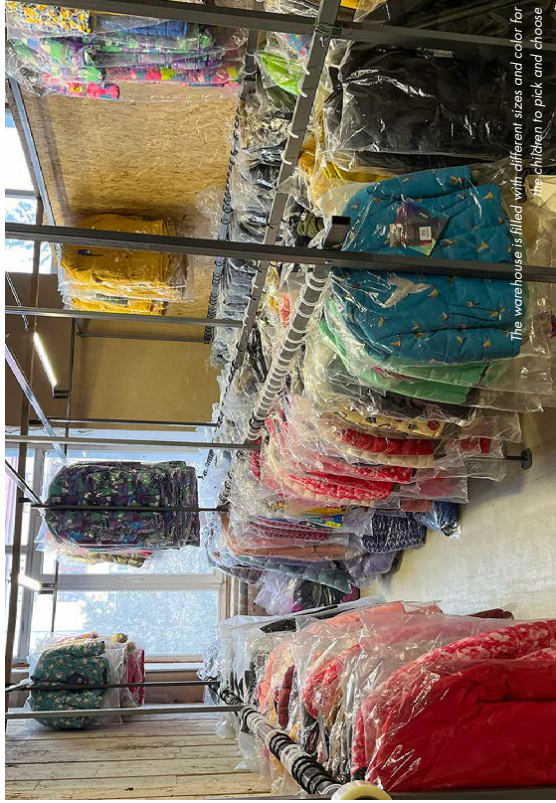
The warehouse is filled with different sizes and color for the children to pick and choose

"A big thank you for the assistance you offered during such a difficult time. You encouraged our children and granted them positive feelings and emotions. If only the world had more such good people!"