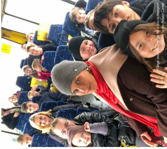
Village councils arrange for a bus to transport the families to the Project Center