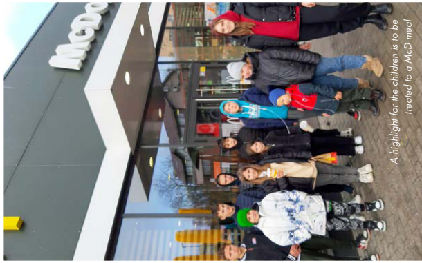
A highlight for the children is to be treated to a McD meal