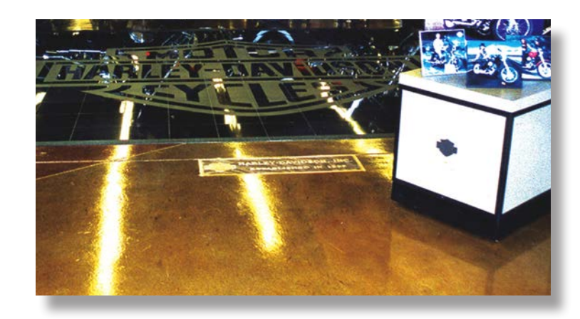
Ideal for: Interior and Exterior Surfaces | Showrooms | Interior Floors

Stain-Crete is ideal for any commercial or residential project needing to enhance any theme or decor with rich color. The resulting distinctive, beautifully marbled, translucent effect looks like natural stone. Stain-Crete can be used in conjunction with surfaces that have already been color hardened or integrally colored.