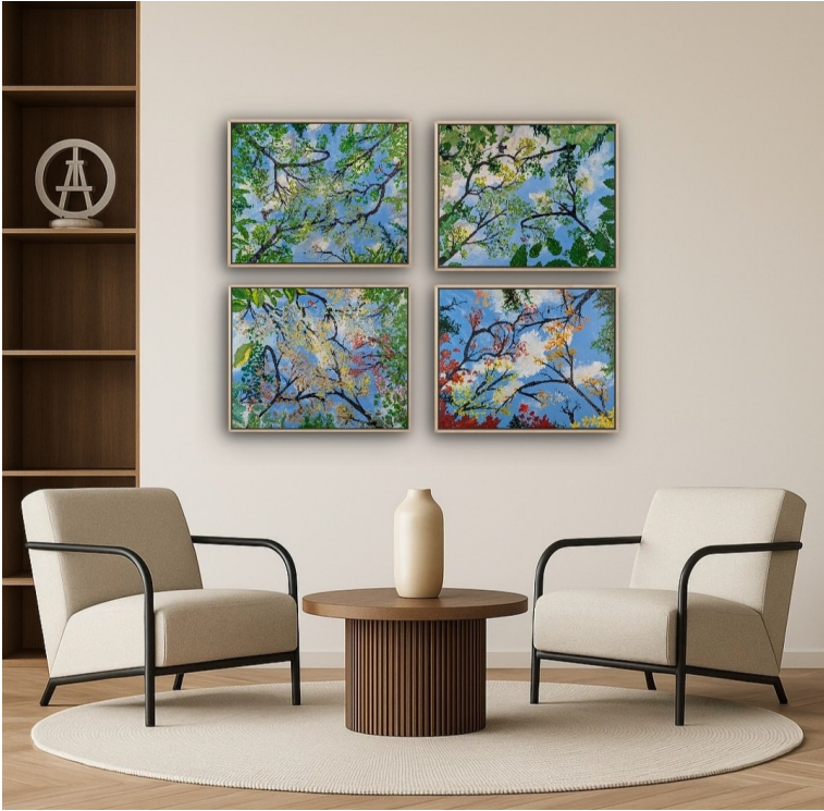
Cloud Dance No's. 4-7, oil on canvas, 20" x 16" each (2026)