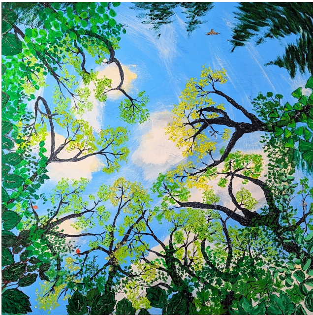
Cloud Dance No. 10, oil on canvas, 30" x 30" (2026)