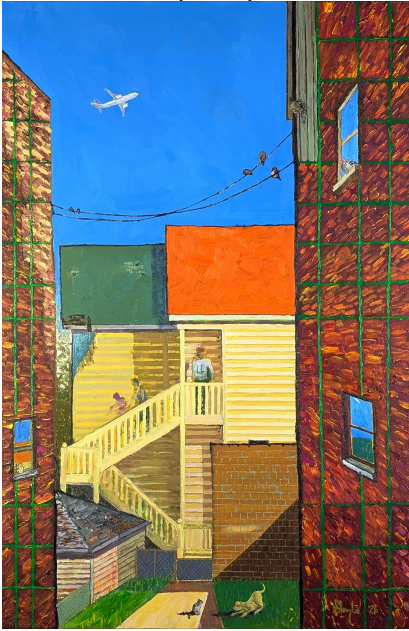
Back Of The Yards, 24" x 36" oil on canvas, (2026)