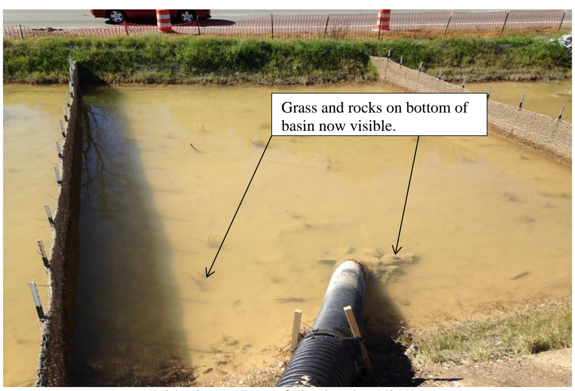
9.8 basin 11:17 a.m. following day 1/21/15 Clear all the way to the bottom