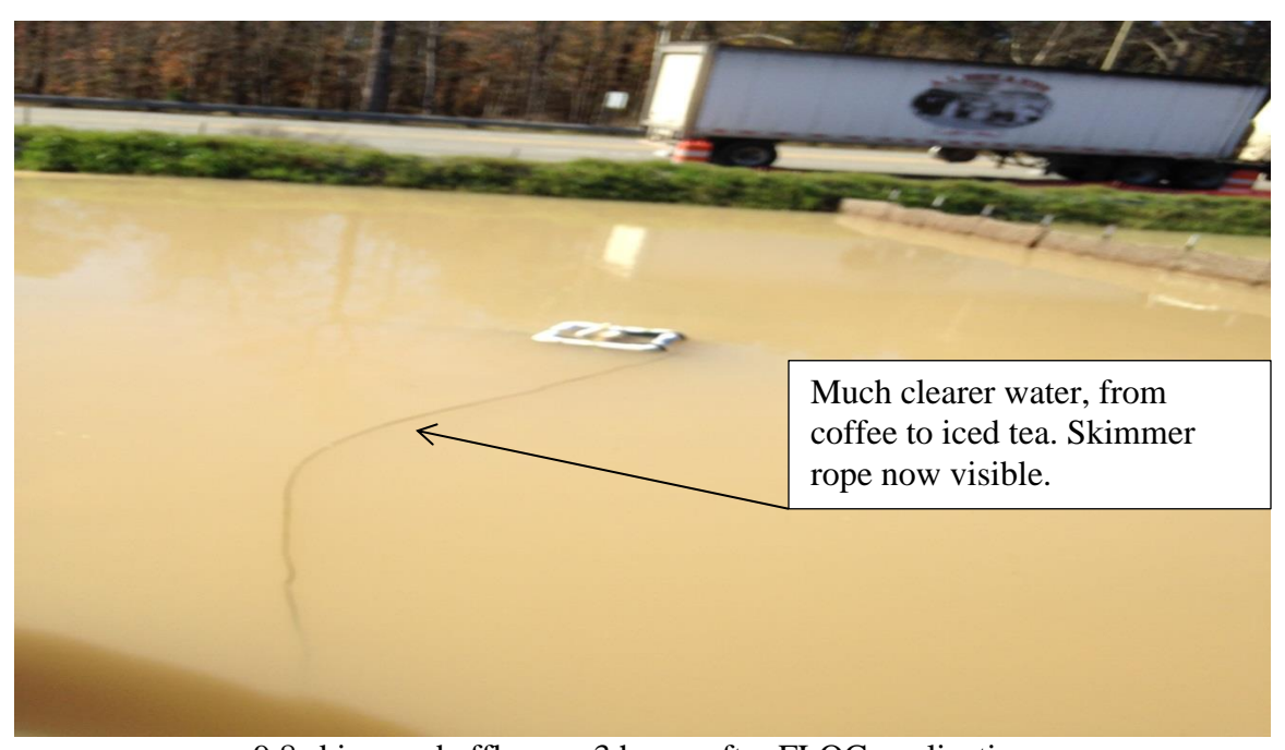
9.8 skimmer baffle area 3 hours after FLOC application