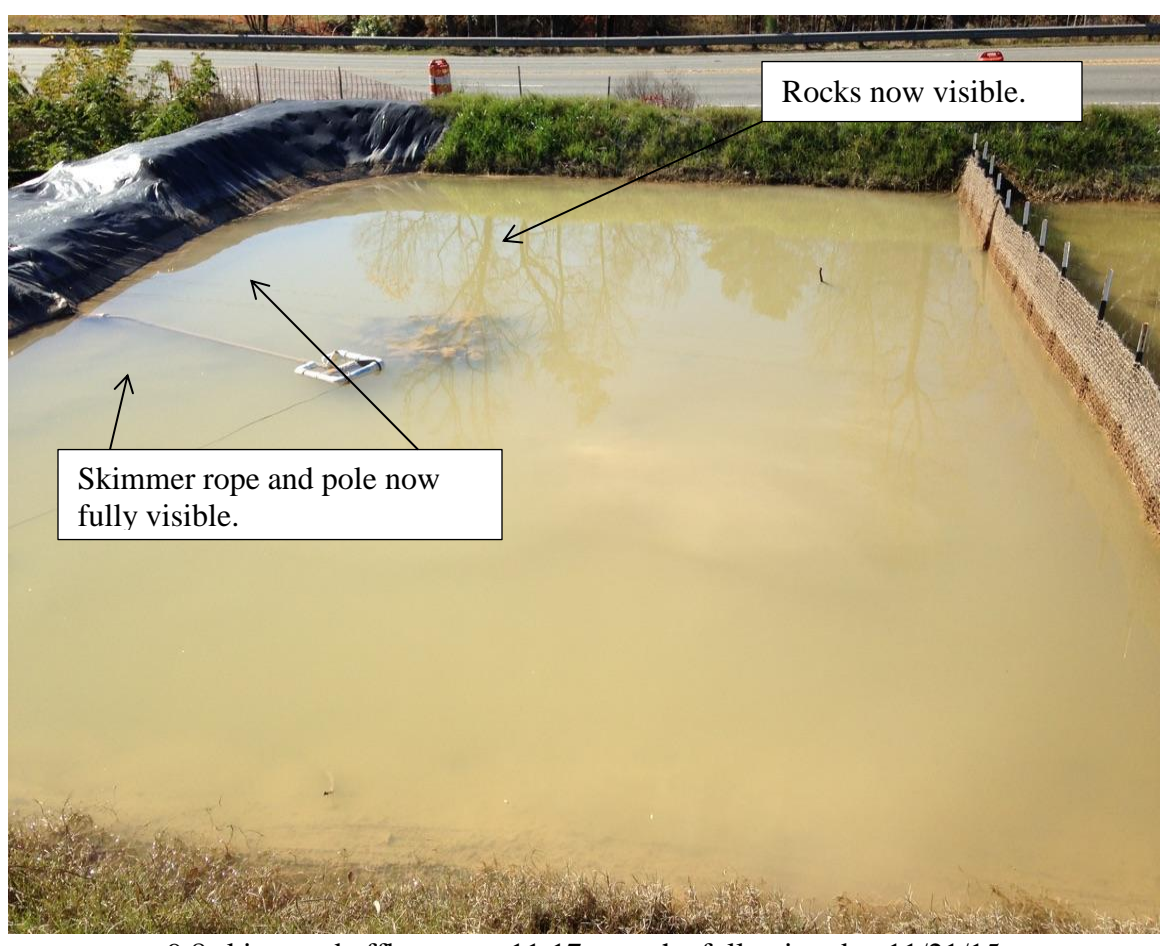
9.8 skimmer baffle area at 11:17 a.m. the following day 11/21/15