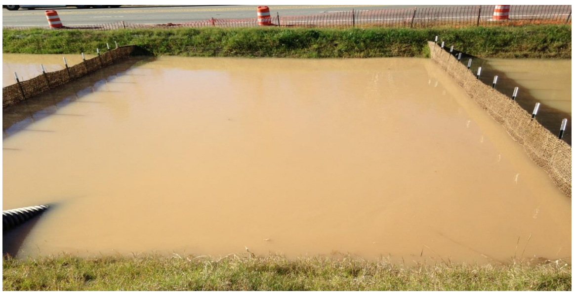
9.8 basin 45 minutes after FLOC application