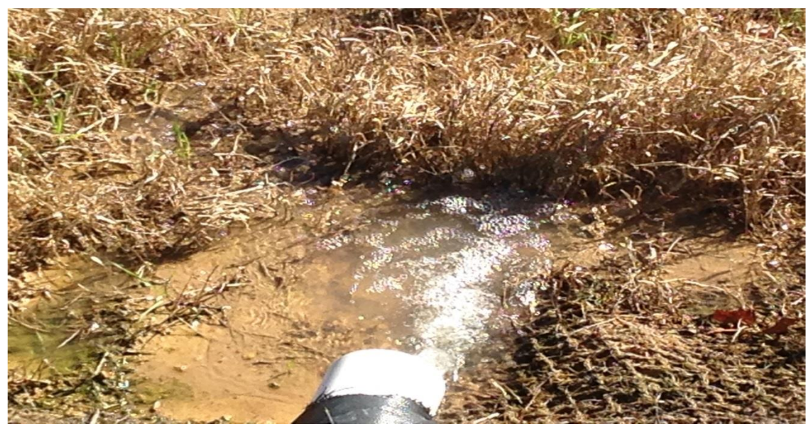
Clear water coming from skimmer discharge pipe at 12:07 p.m. (3 hours after FLOC application)