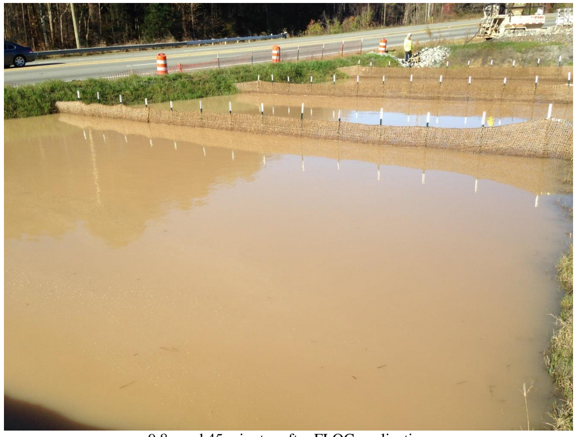
9.8 pond 45 minutes after FLOC application