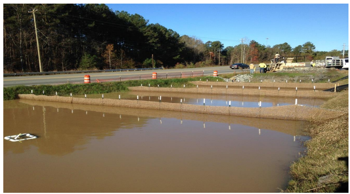
9.8 skimmer baffle area before FLOC treatment