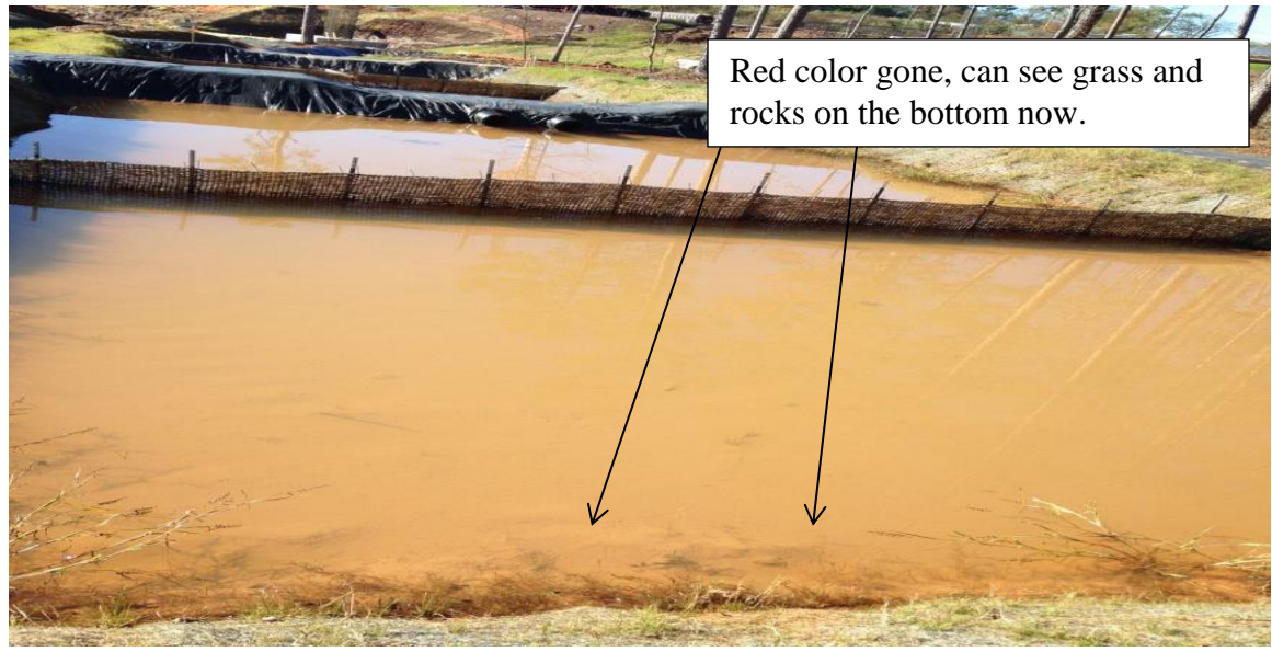
12.5 top tier basin after treatment 11/21/15 at 10:13 a.m. Clear to the bottom