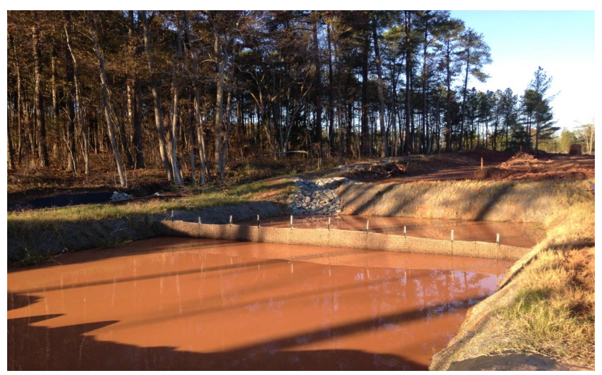
12.5 top tier basin before treatment