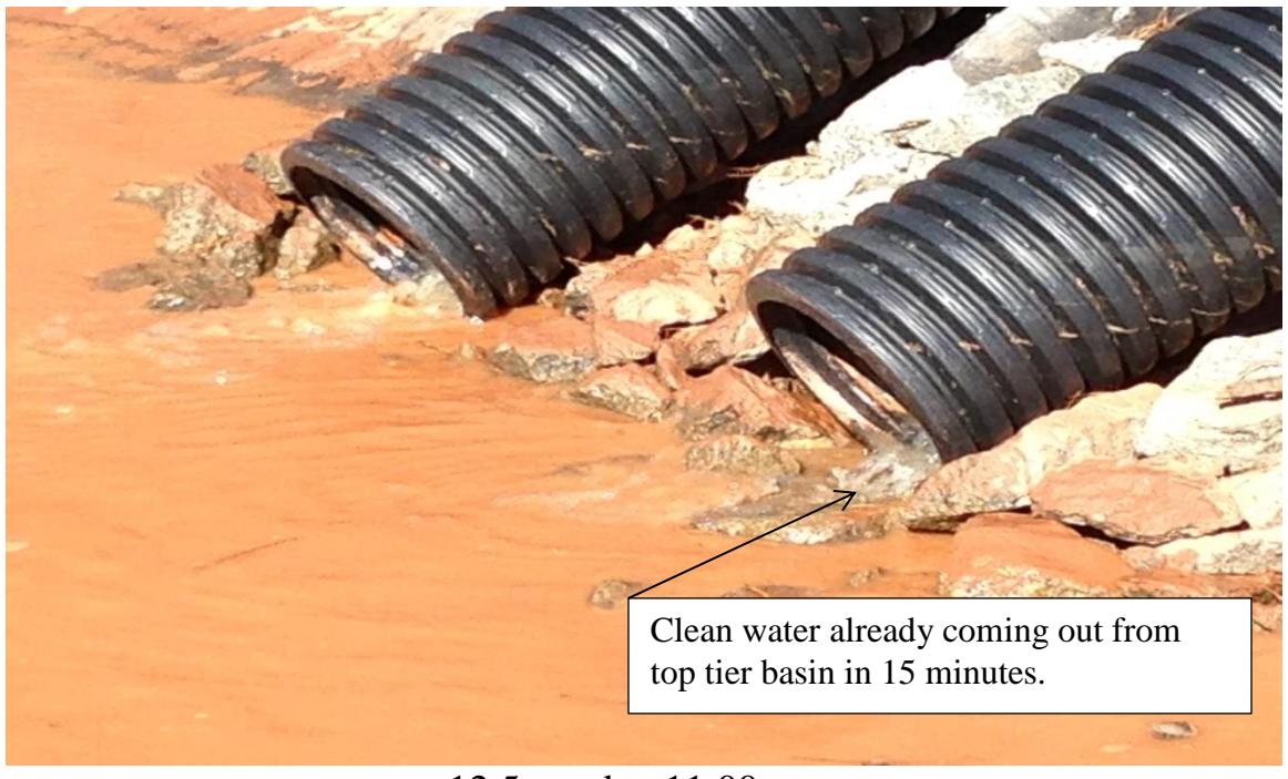
12.5 pond at 11:00 a.m.