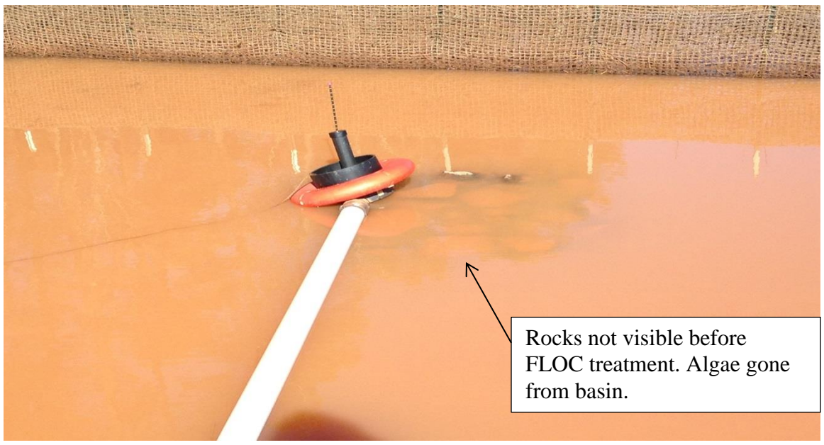
12.5 bottom skimmer basin after FLOC treatment 12:29 p.m. 1.75 hours after treatment