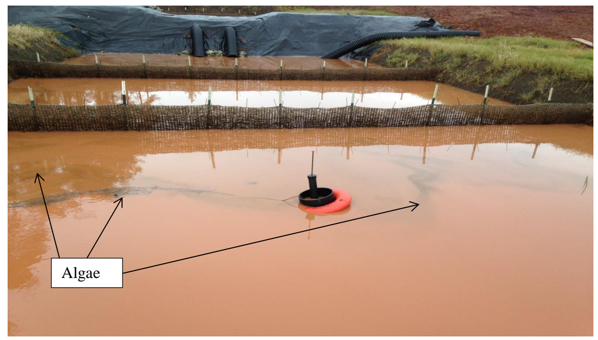
12.5 bottom skimmer basin before FLOC treatment 10:30 a.m. 11/20/15