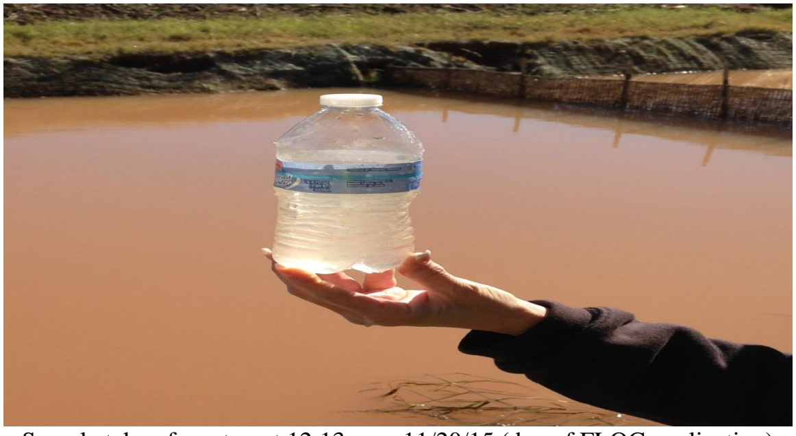
Sample taken from top at 12:13 p.m. 11/20/15 (day of FLOC application)