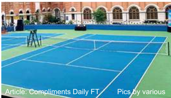
Article: Compliments Daily FT