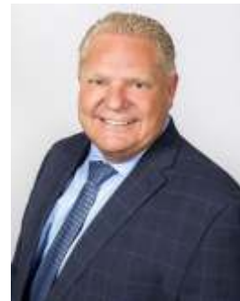
Doug Ford Premier

I wish all of you the hope and renewal that comes with the new year. Have a happy, healthy and prosperous 2023!