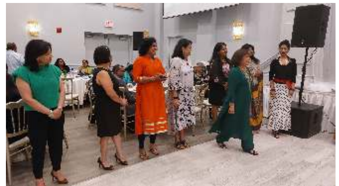
31 ST ANNUAL NEW YEAR'S EVE ROYAL GALA DINNER DANCE