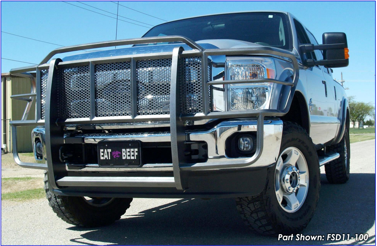
Part Shown: FSD11-100