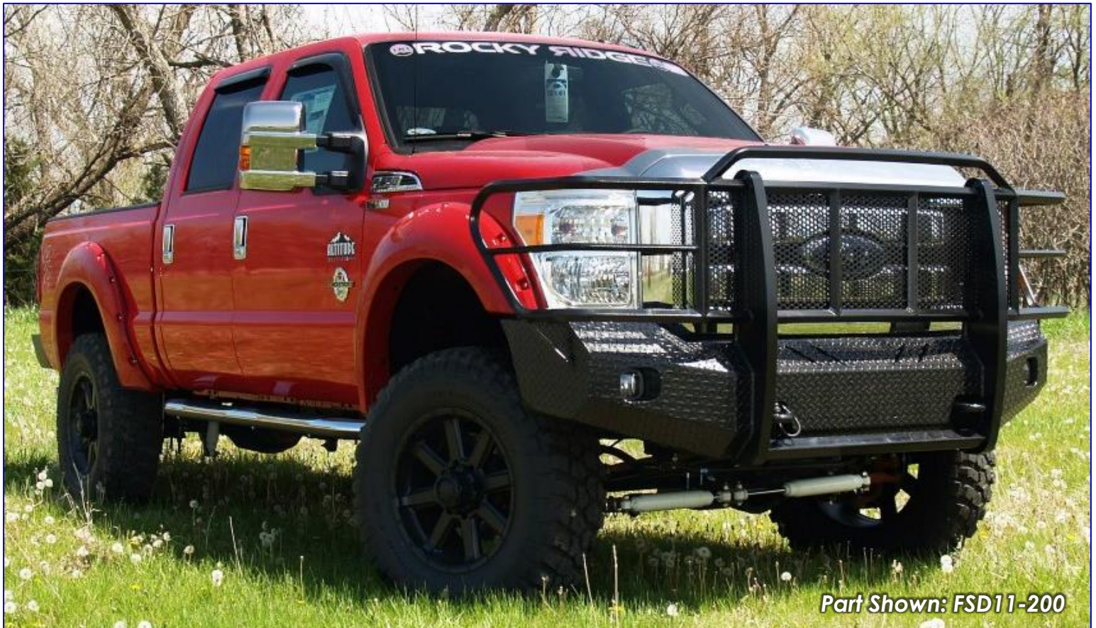
Part Shown: FSD11-200