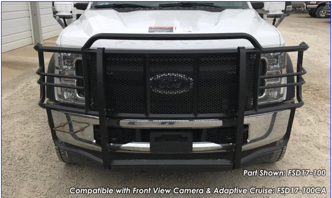
Part Shown: FSD17-100