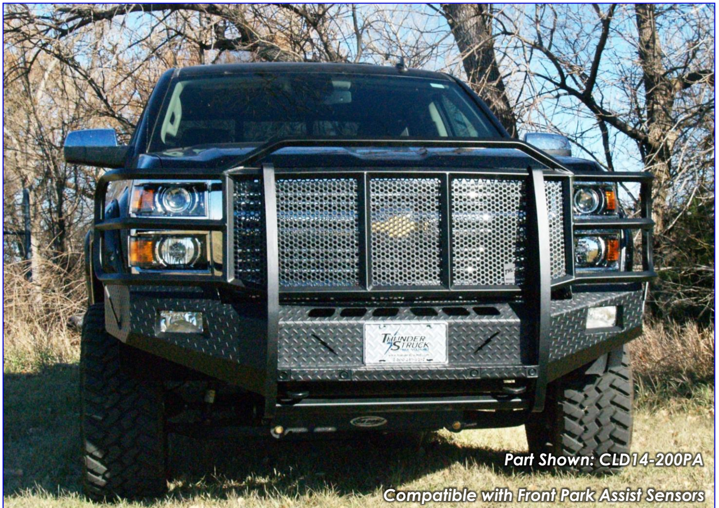
Part Shown: CLD14-200PA

Compatible with Front Park Assist Sensors