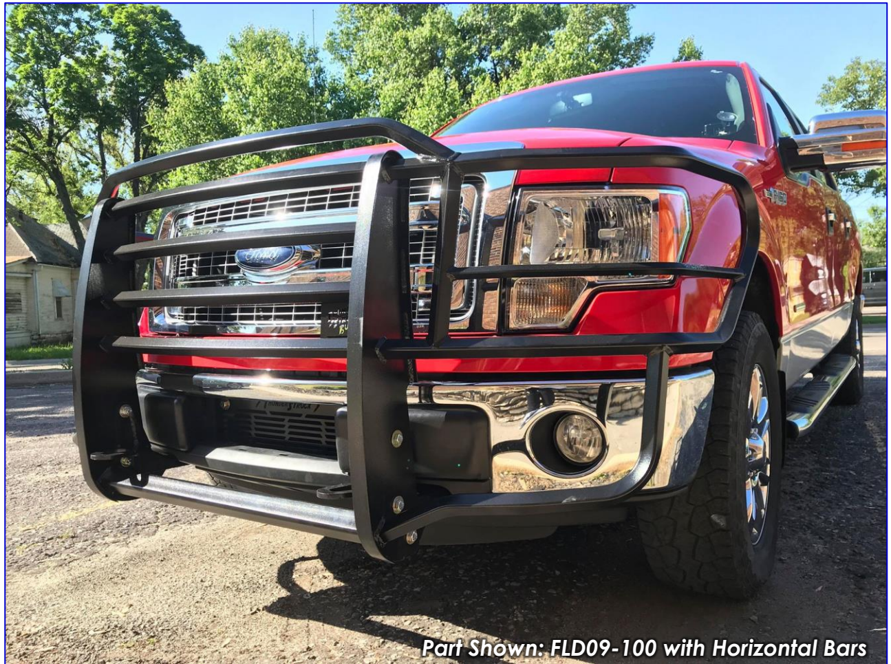
Part Shown: FLD09-100 with Horizontal Bars