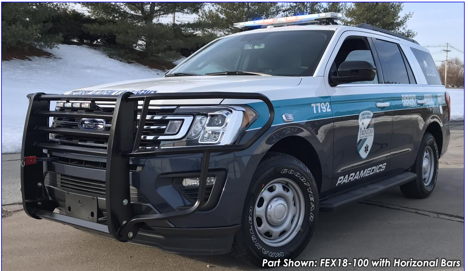
Part Shown: FEX18-100 with Horizontal Bars