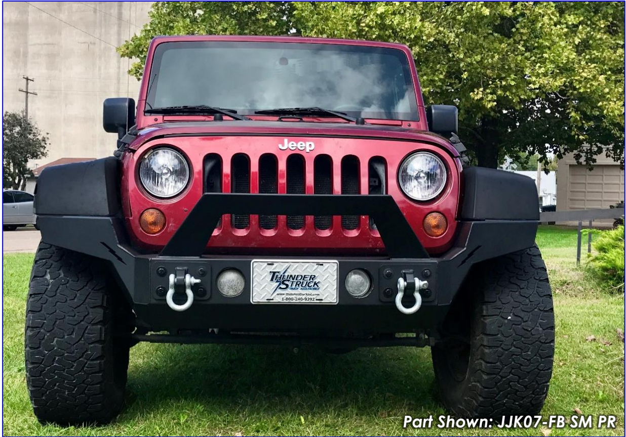
Part Shown: JJK07-FB SM PR