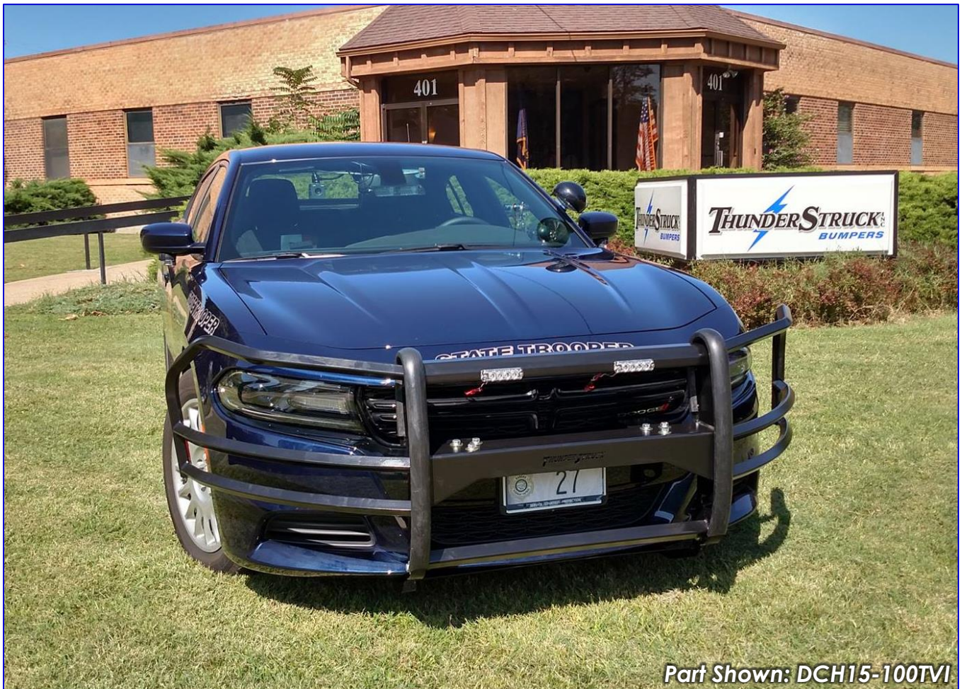
Part Shown: DCH15-100TVI