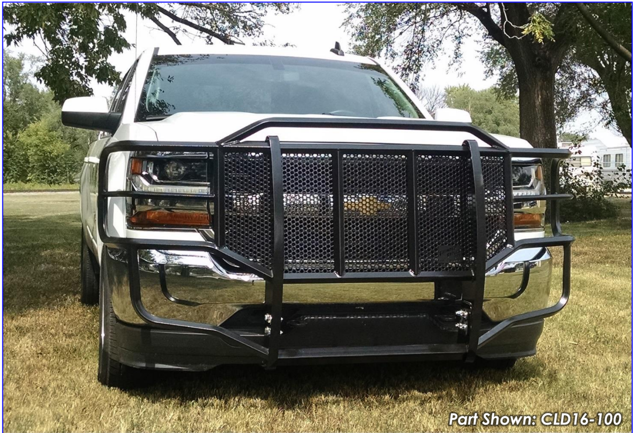
Part Shown: CLD16-100