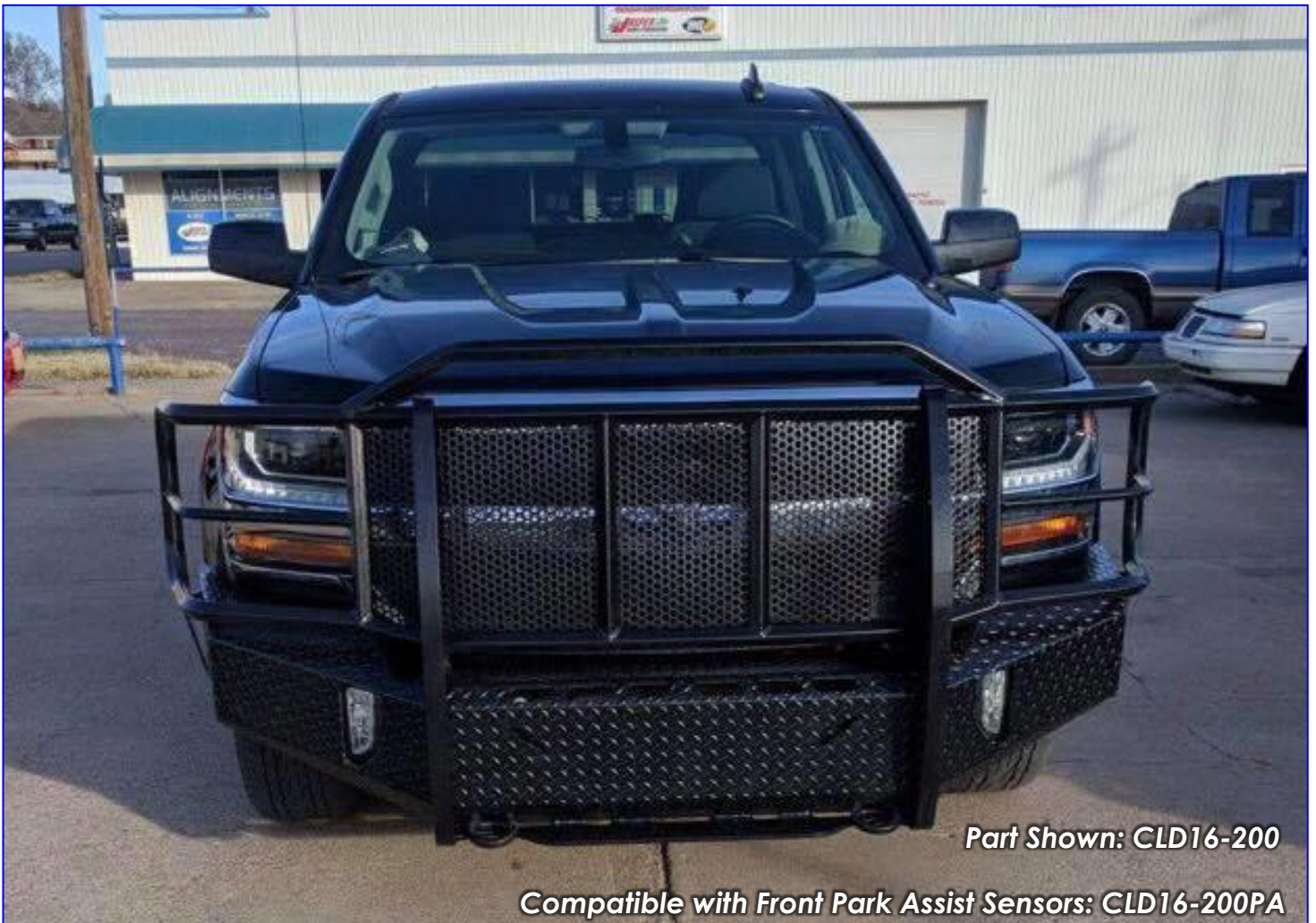
Part Shown: CLD16-200

Compatible with Front Park Assist Sensors: CLD16-200PA