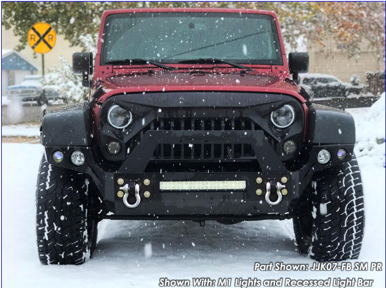
Part Shown: JJK07-FB SM PR