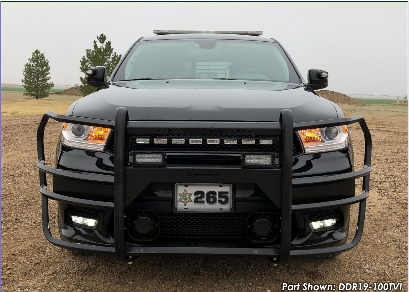
Part Shown: DDR19-100TVI