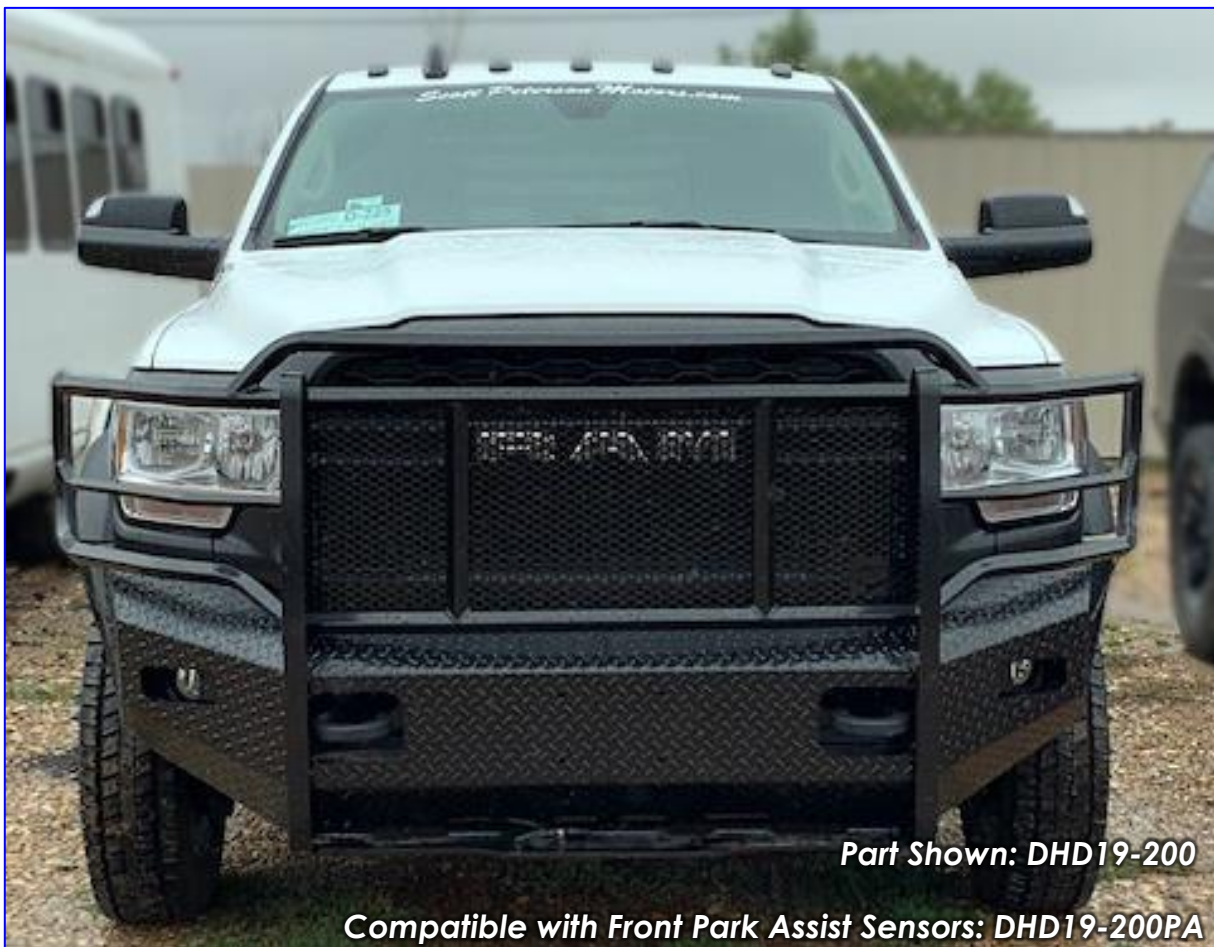
Part Shown: DHD19-200

Compatible with Front Park Assist Sensors: DHD19-200PA