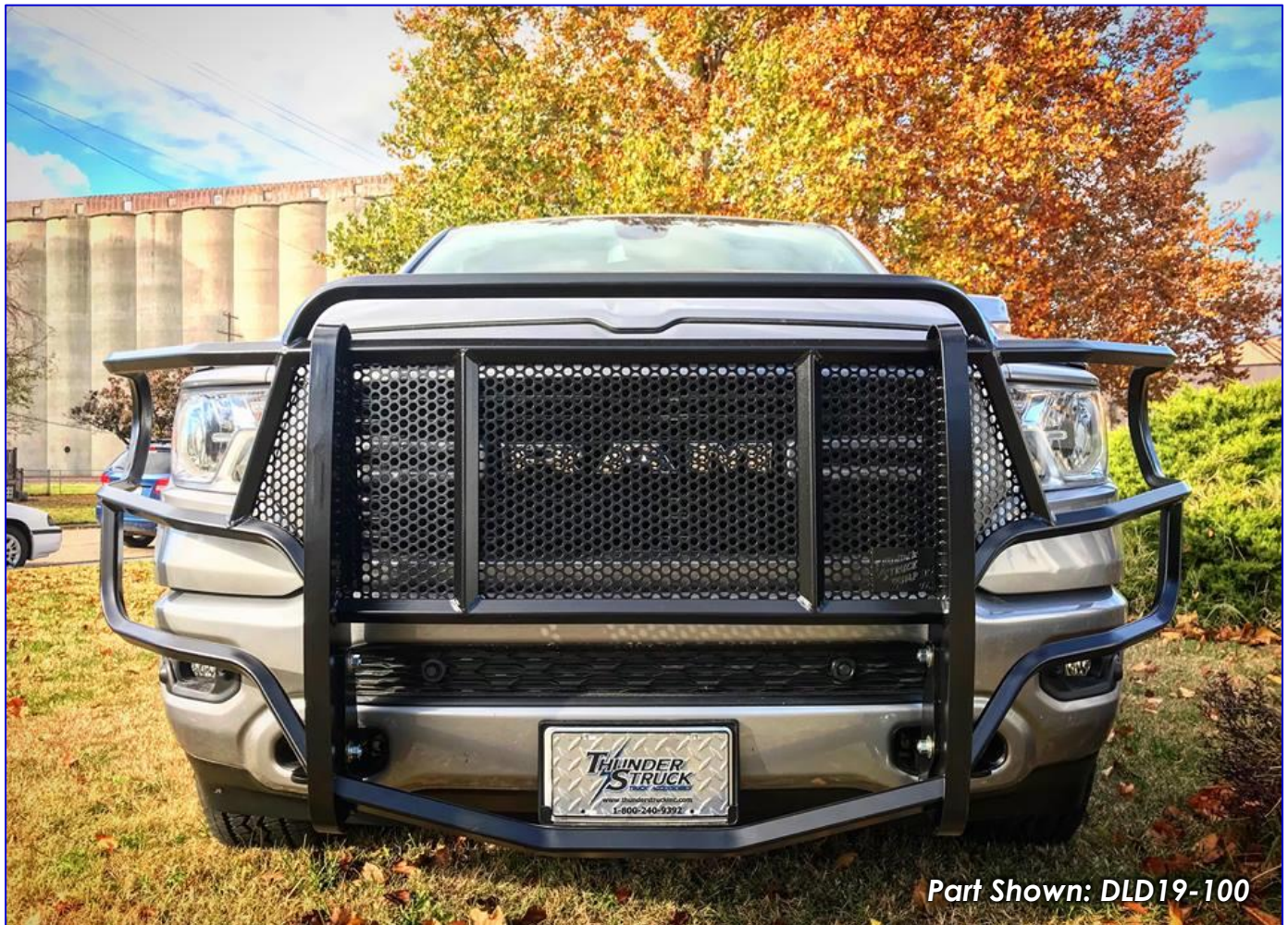
Part Shown: DLD19-100