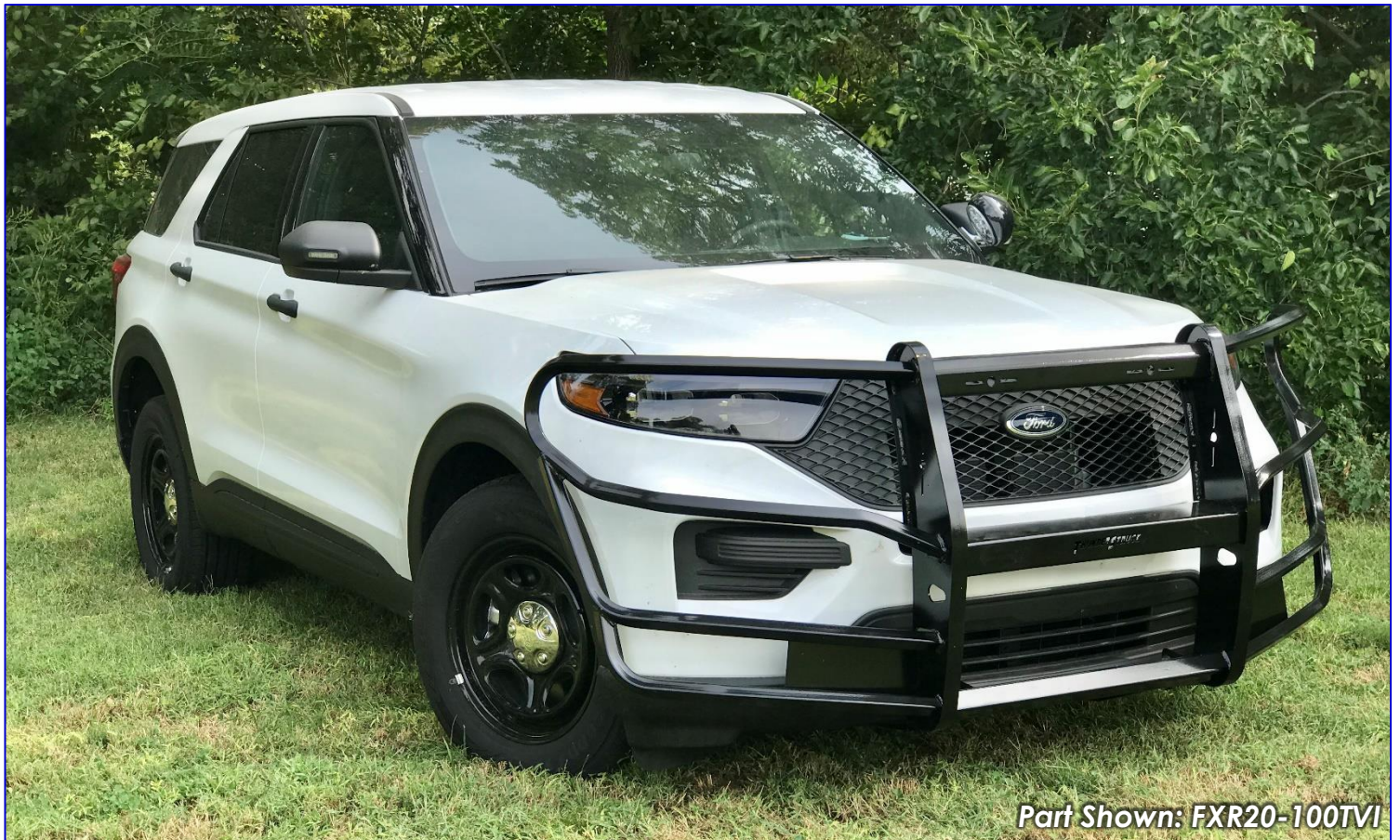
Part Shown: FXR20-100TVI