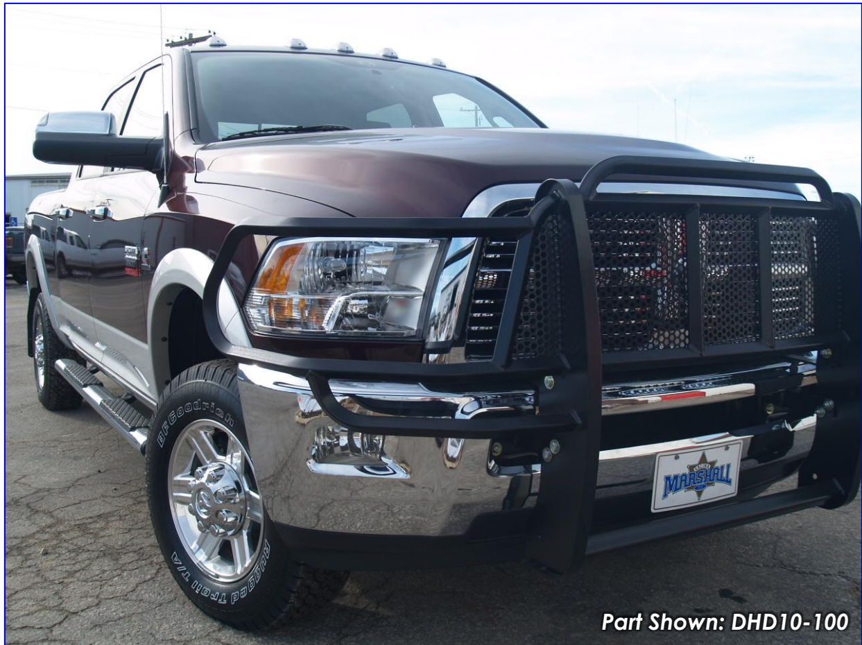
Part Shown: DHD10-100