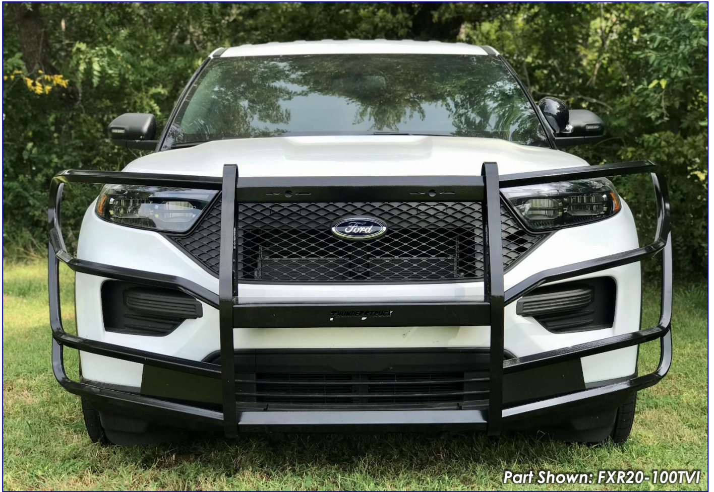
Part Shown: FXR20-100TVI