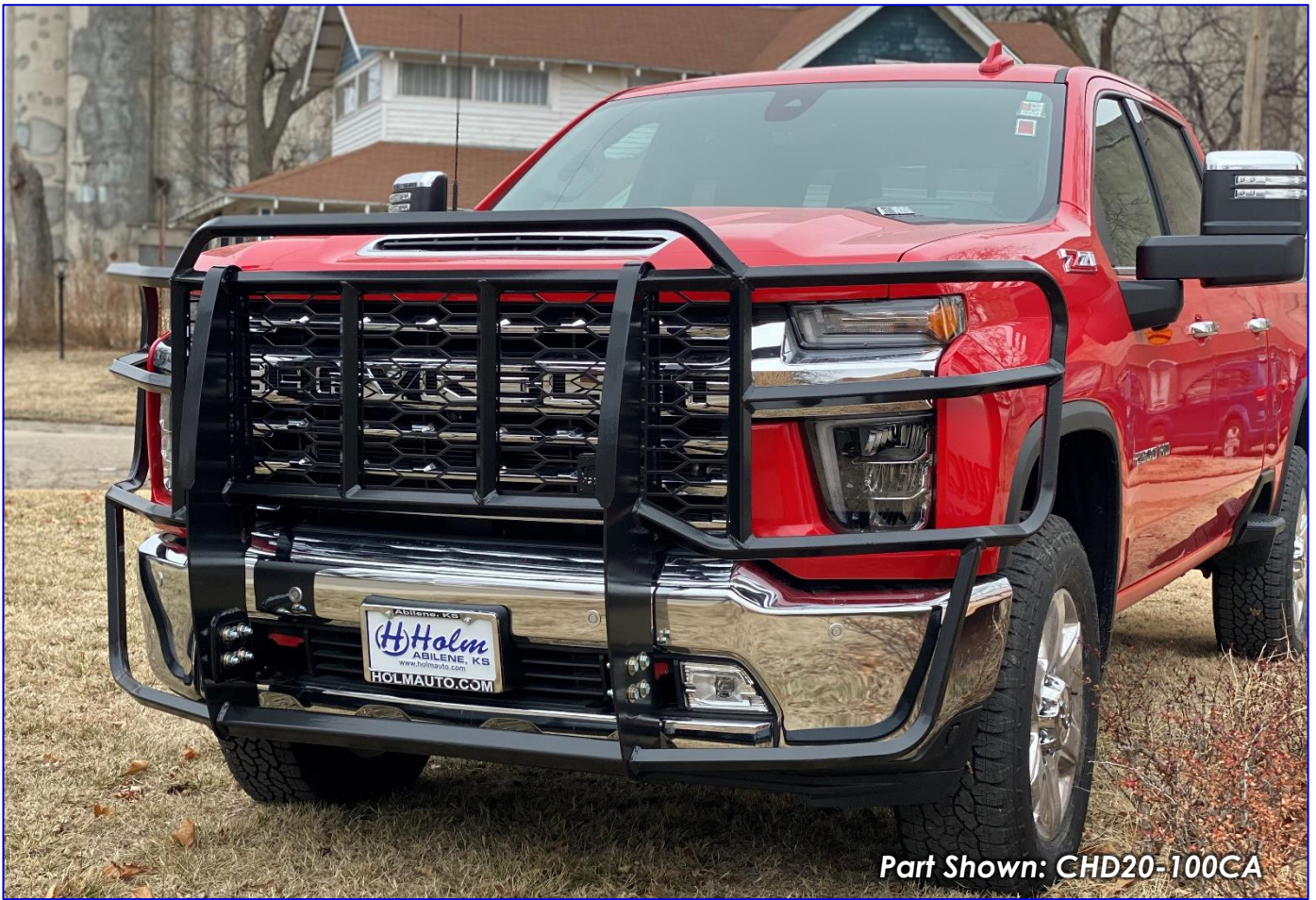
Part Shown: CHD20-100CA