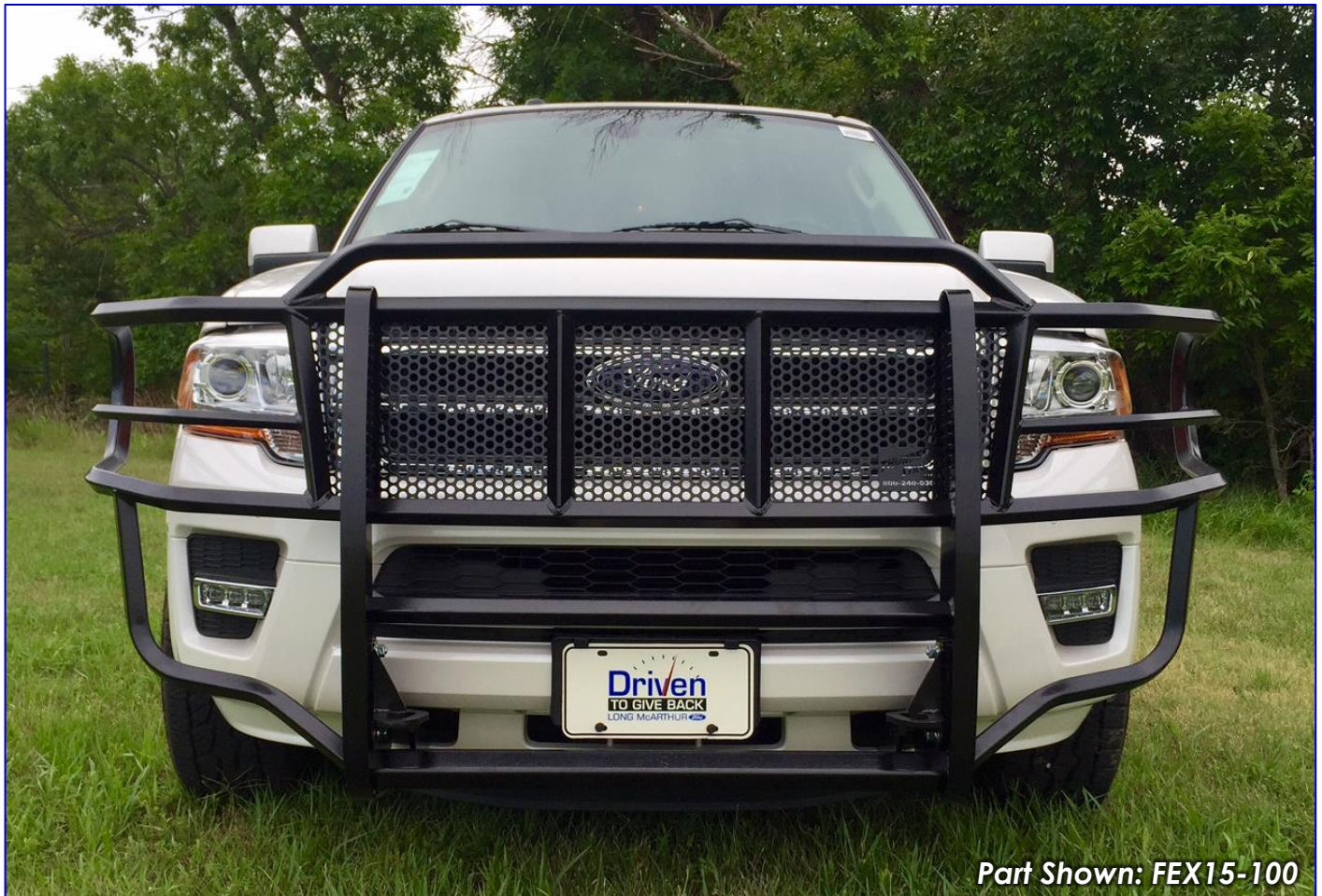
Part Shown: FEX15-100