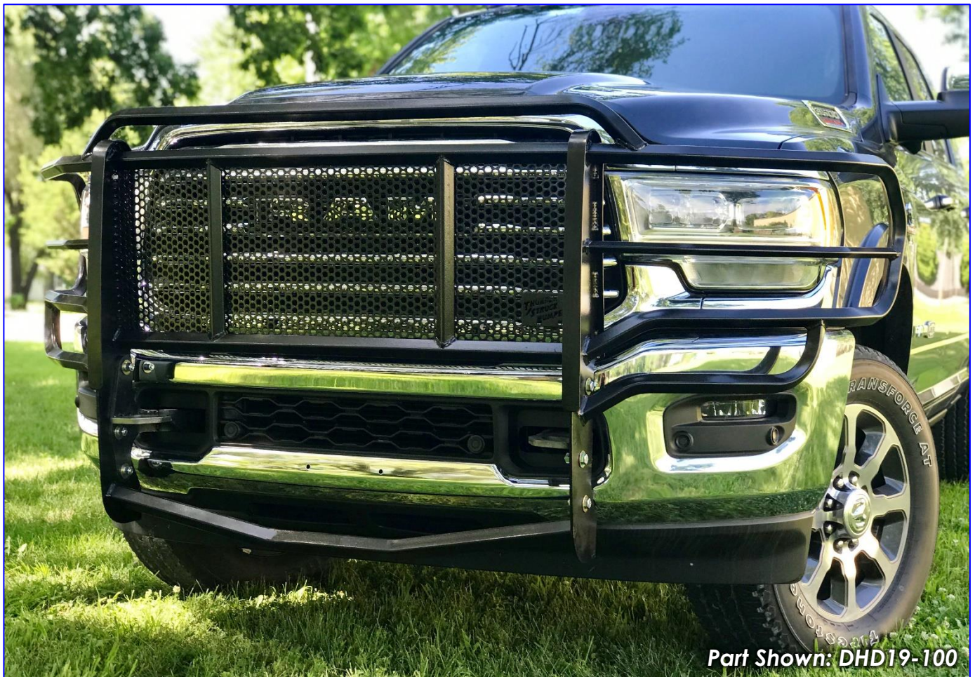
Part Shown: DHD19-100