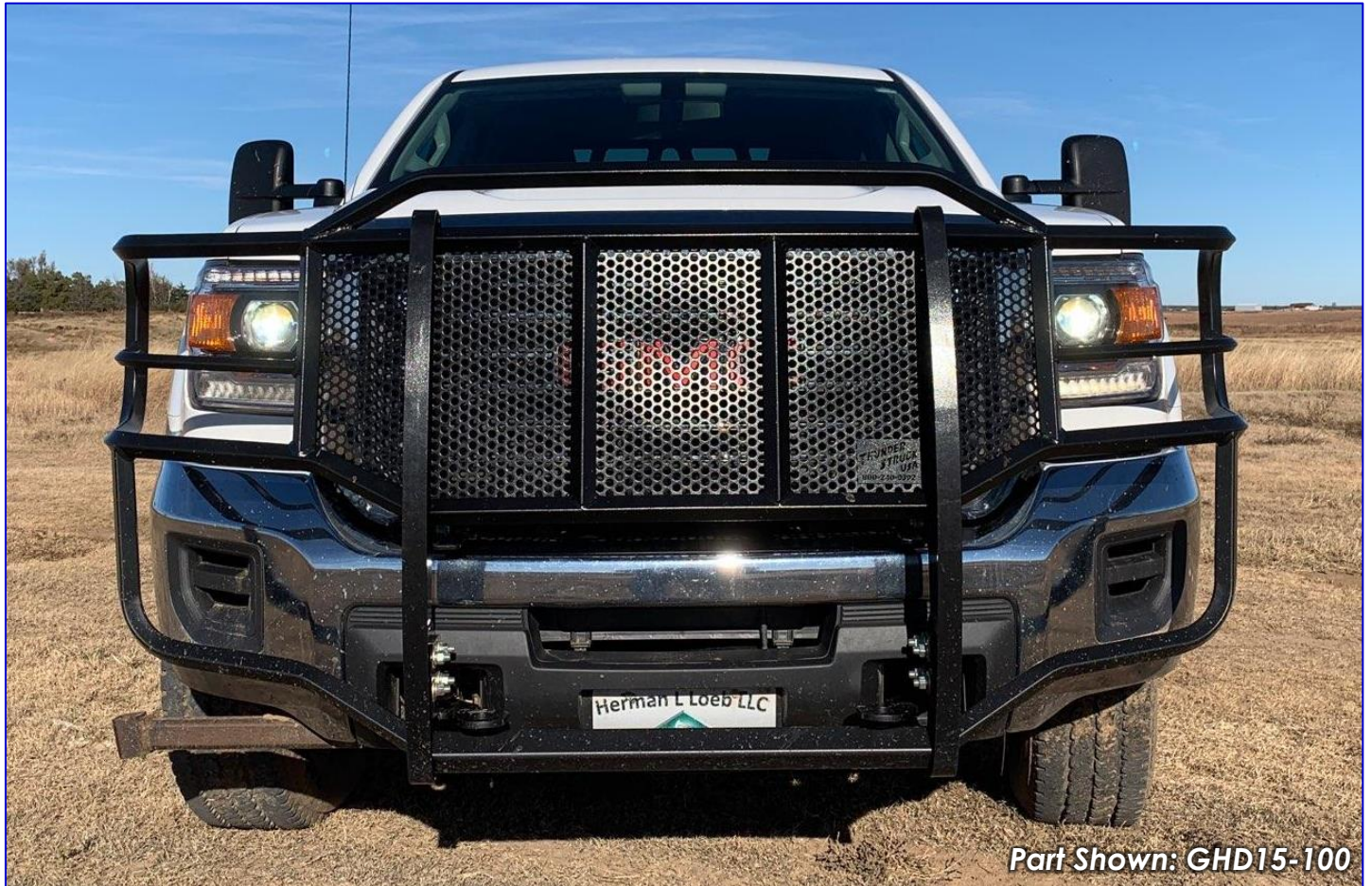
Part Shown: GHD15-100