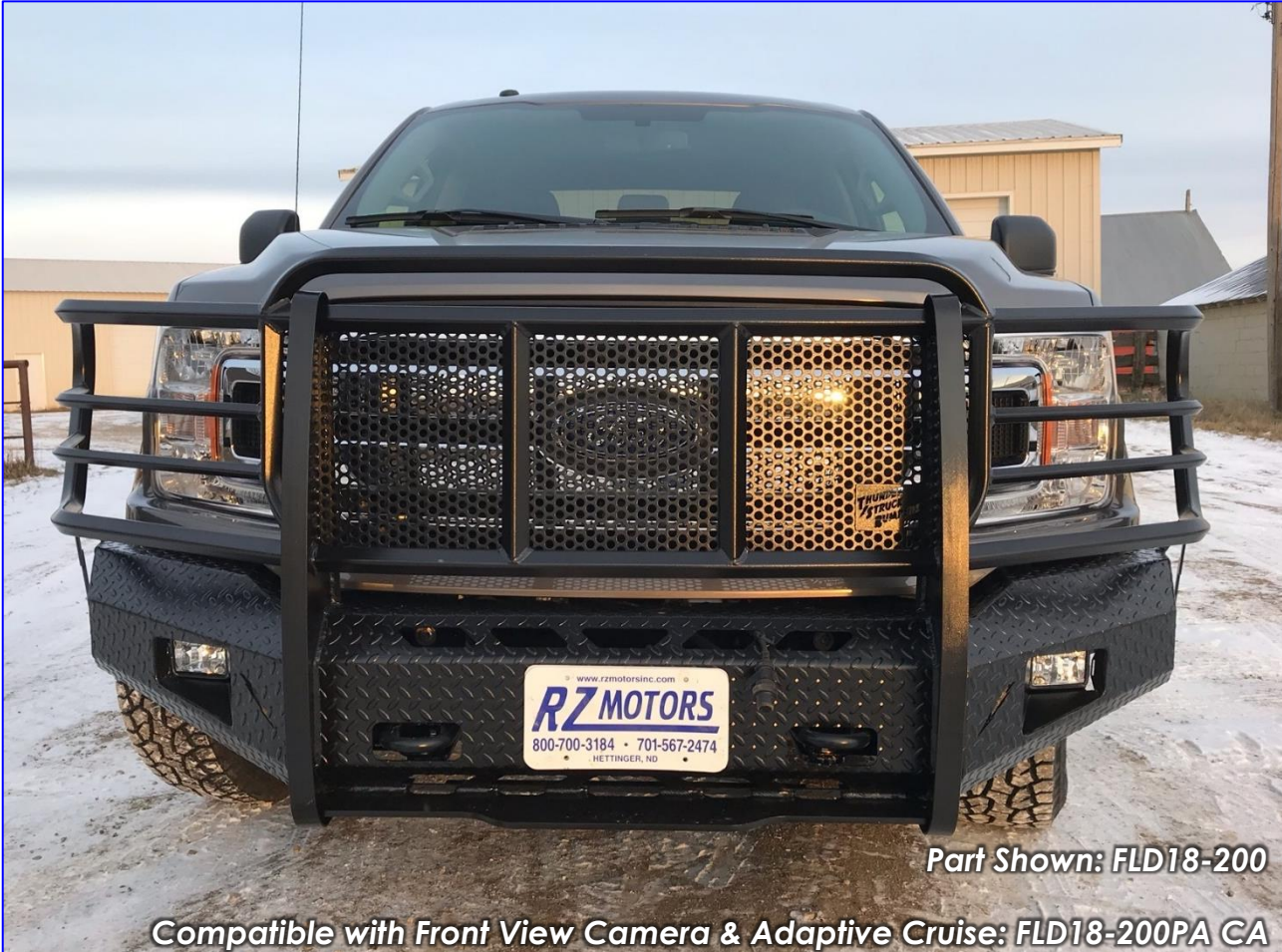
Part Shown: FLD18-200

Compatible with Front View Camera: FLD18-200CA