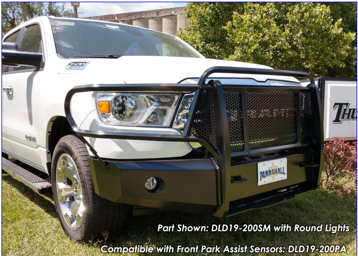
Part Shown: DLD19-200SM with Round Lights