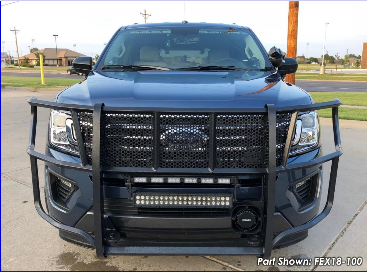
Part Shown: FEX18-100