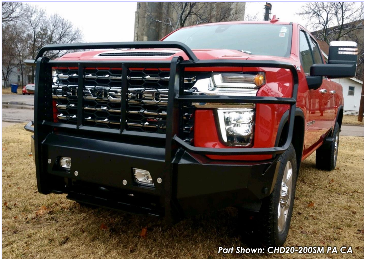
Part Shown: CHD20-200SM PA CA