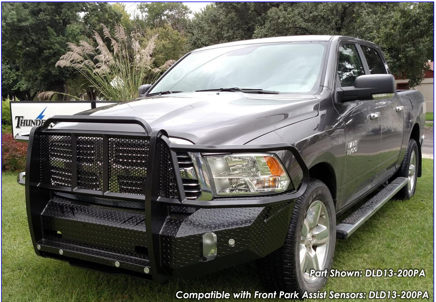
Part Shown: DLD13-200PA

Compatible with Front Park Assist Sensors: DLD13-200PA