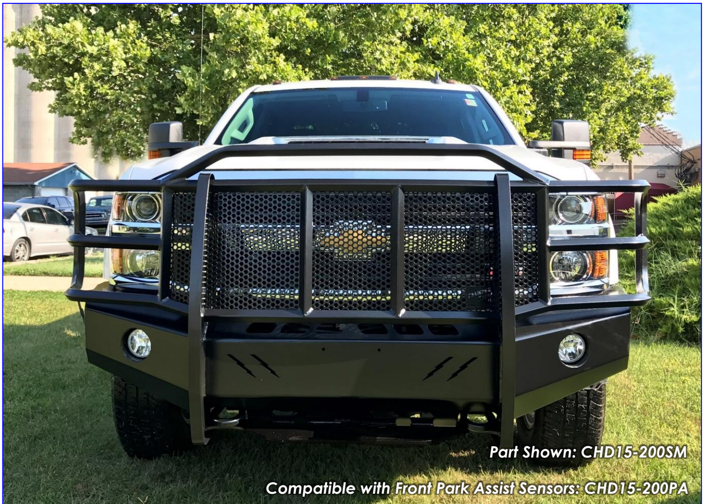
Part Shown: CHD15-200SM

Compatible with Front Park Assist Sensors: CHD15-200PA