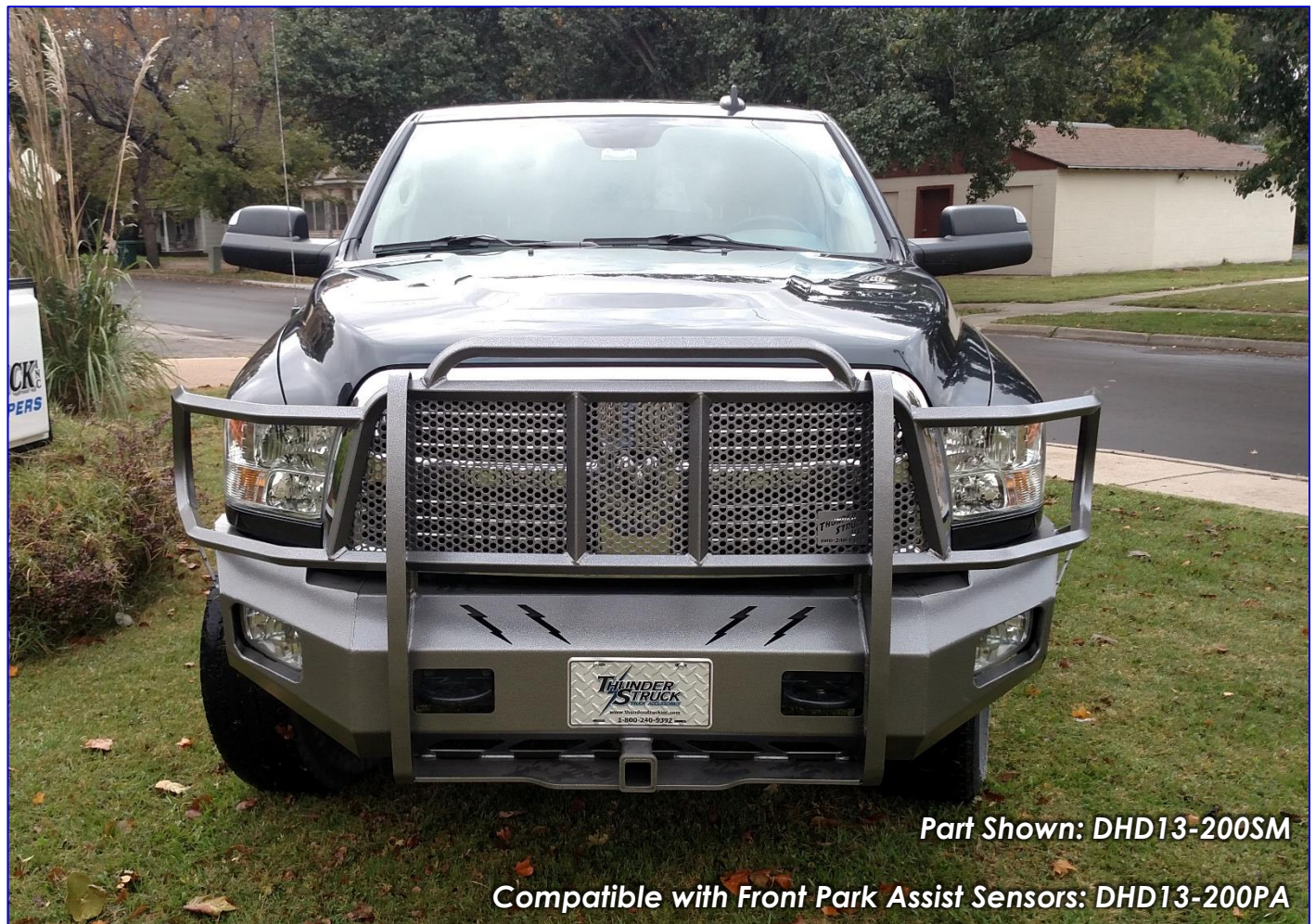
Part Shown: DHD13-200SM

Compatible with Front Park Assist Sensors: DHD13-200PA