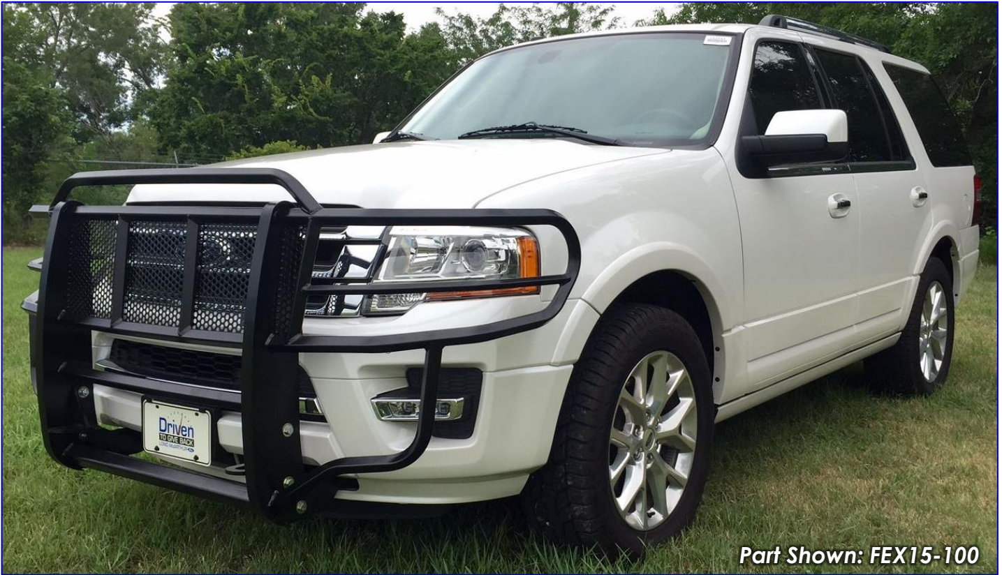
Part Shown: FEX15-100