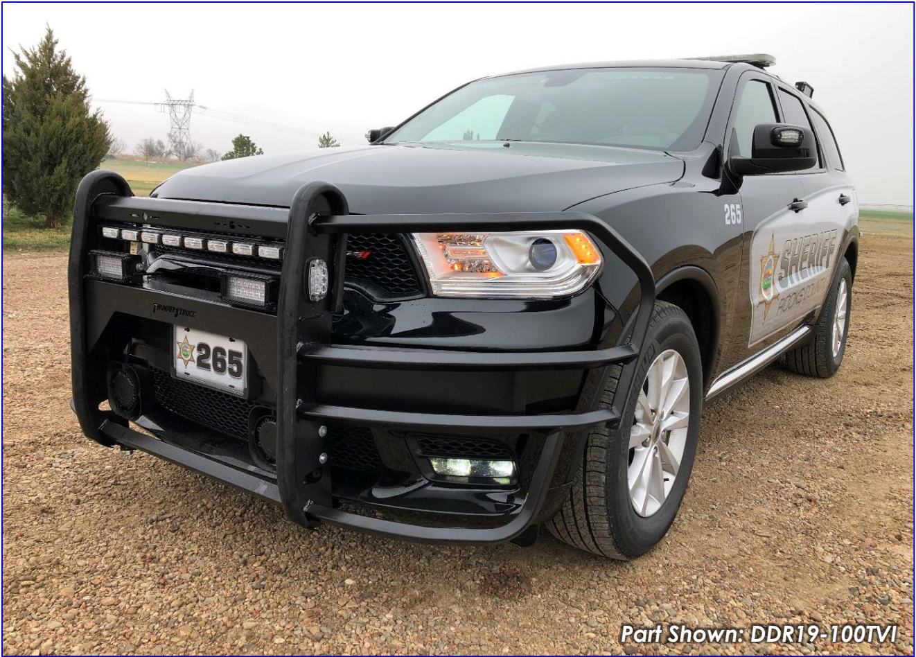
Part Shown: DDR19-100TVI