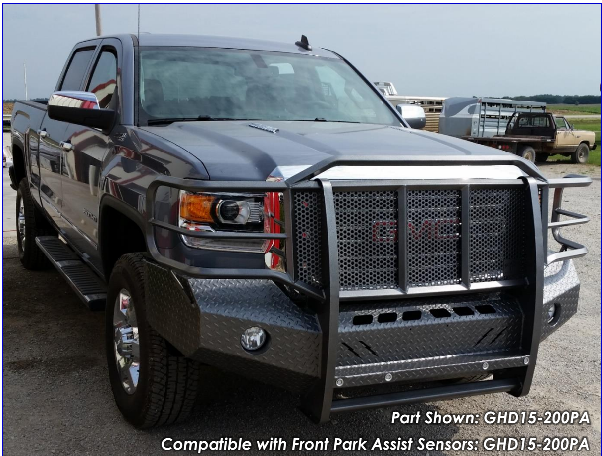
Part Shown: GHD15-200PA