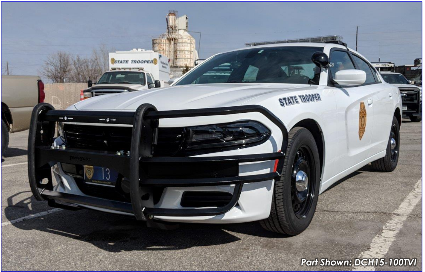
Part Shown: DCH15-100TVI