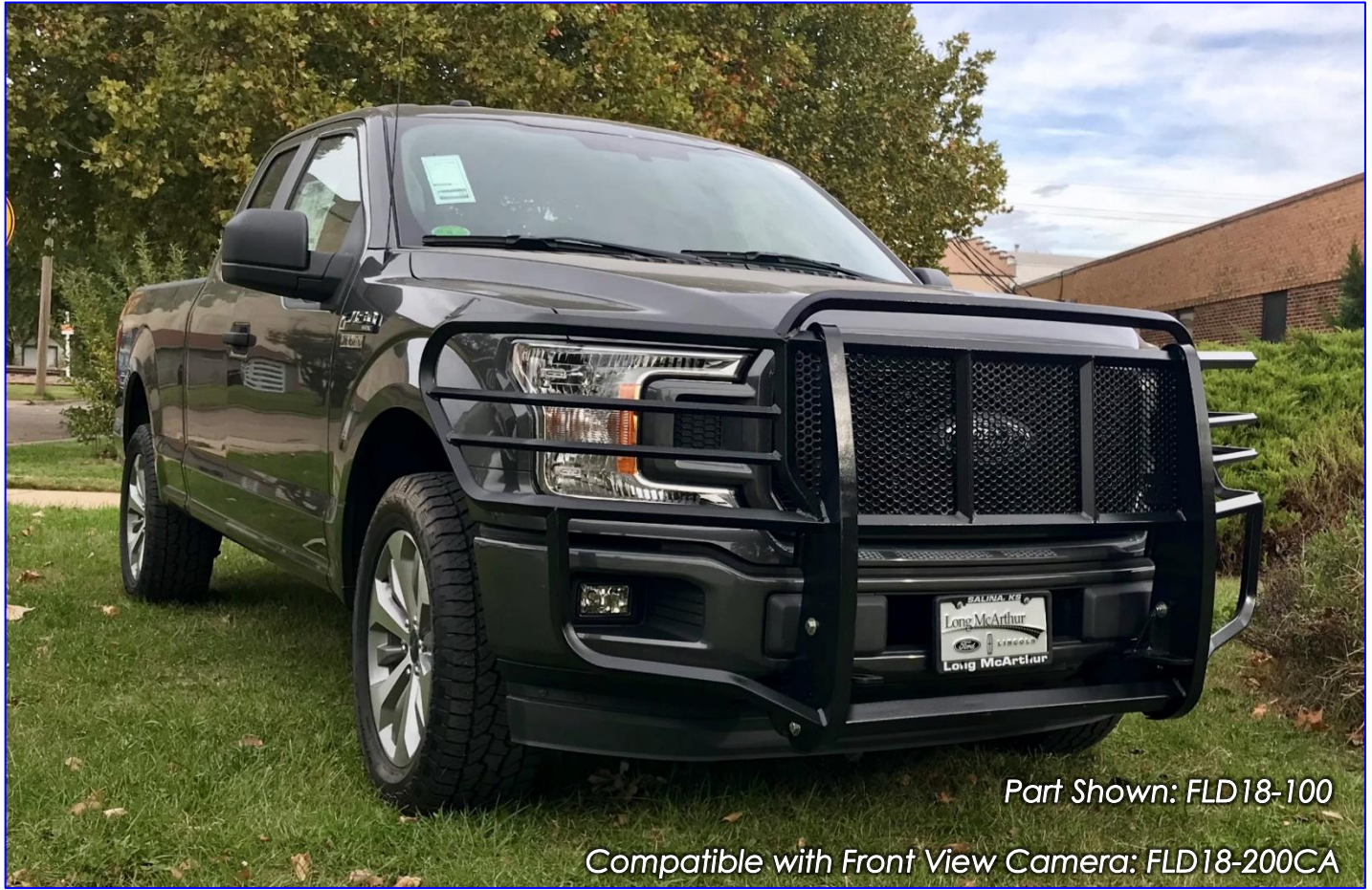
Part Shown: FLD18-100

Compatible with Front View Camera: FLD18-200CA