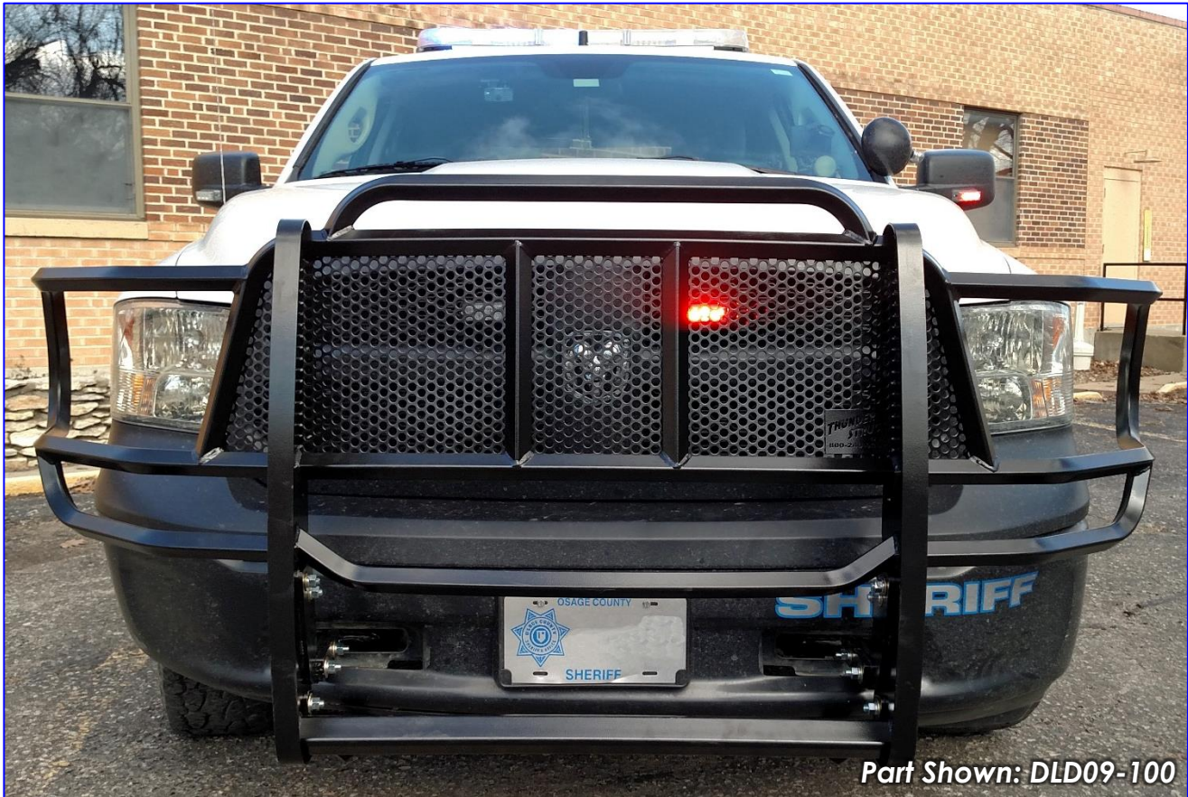
Part Shown: DLD09-100