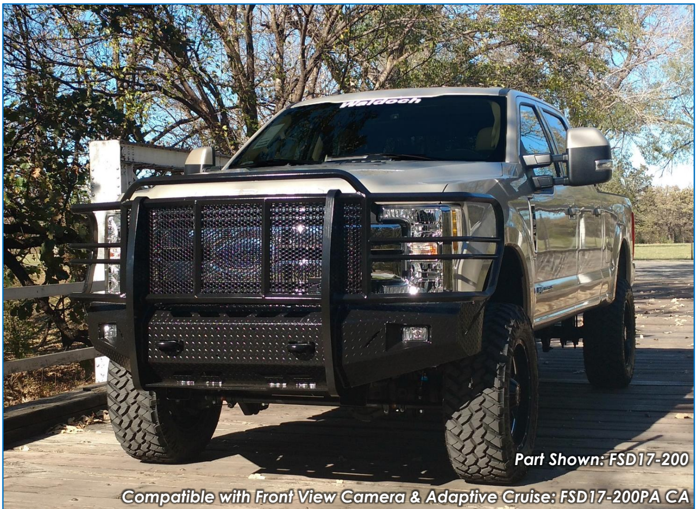
Part Shown: FSD17-200