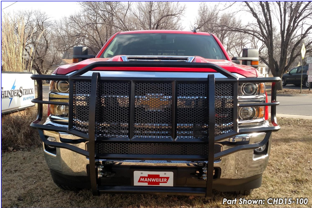
Part Shown: CHD15-100