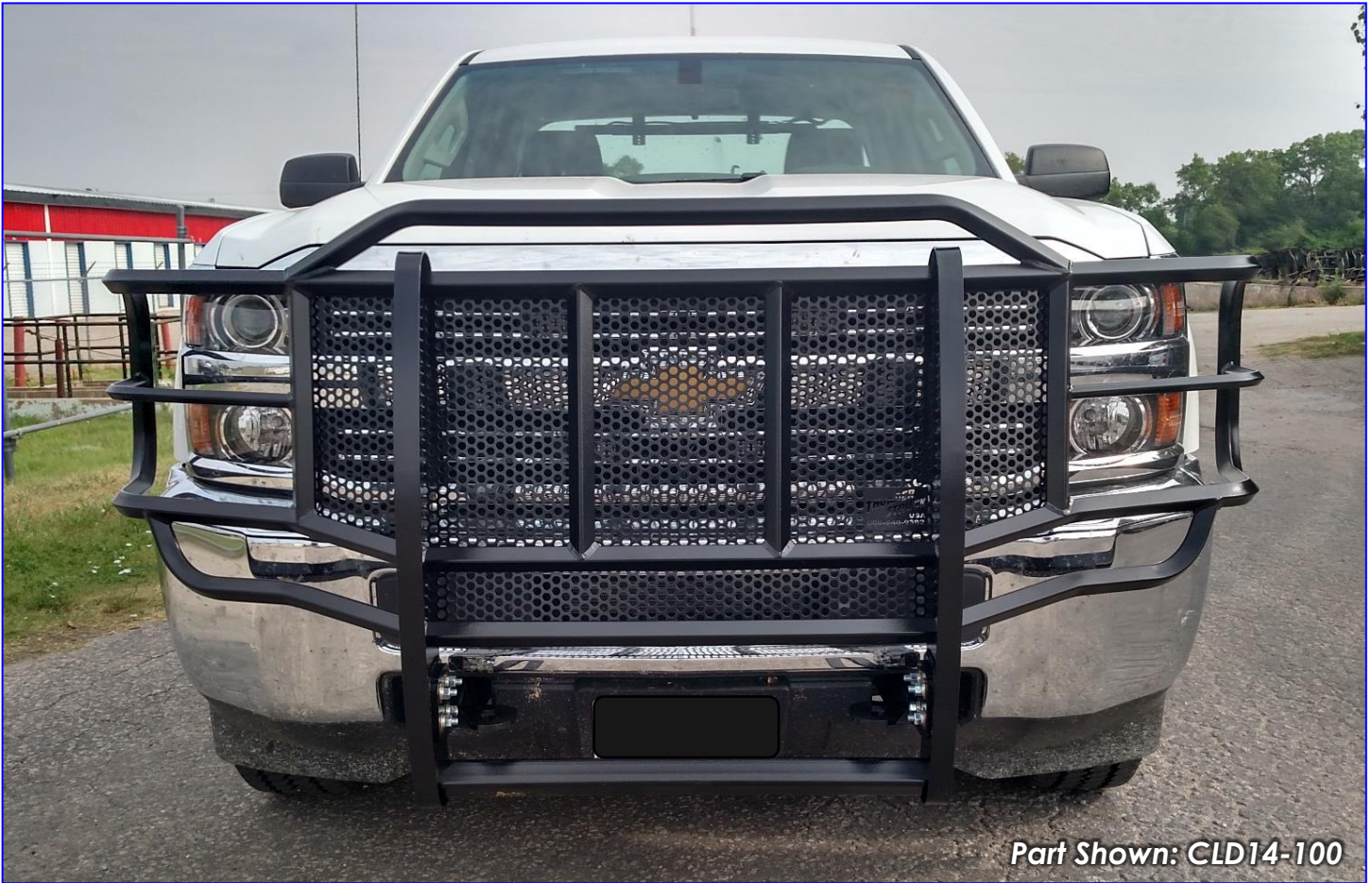
Part Shown: CLD14-100