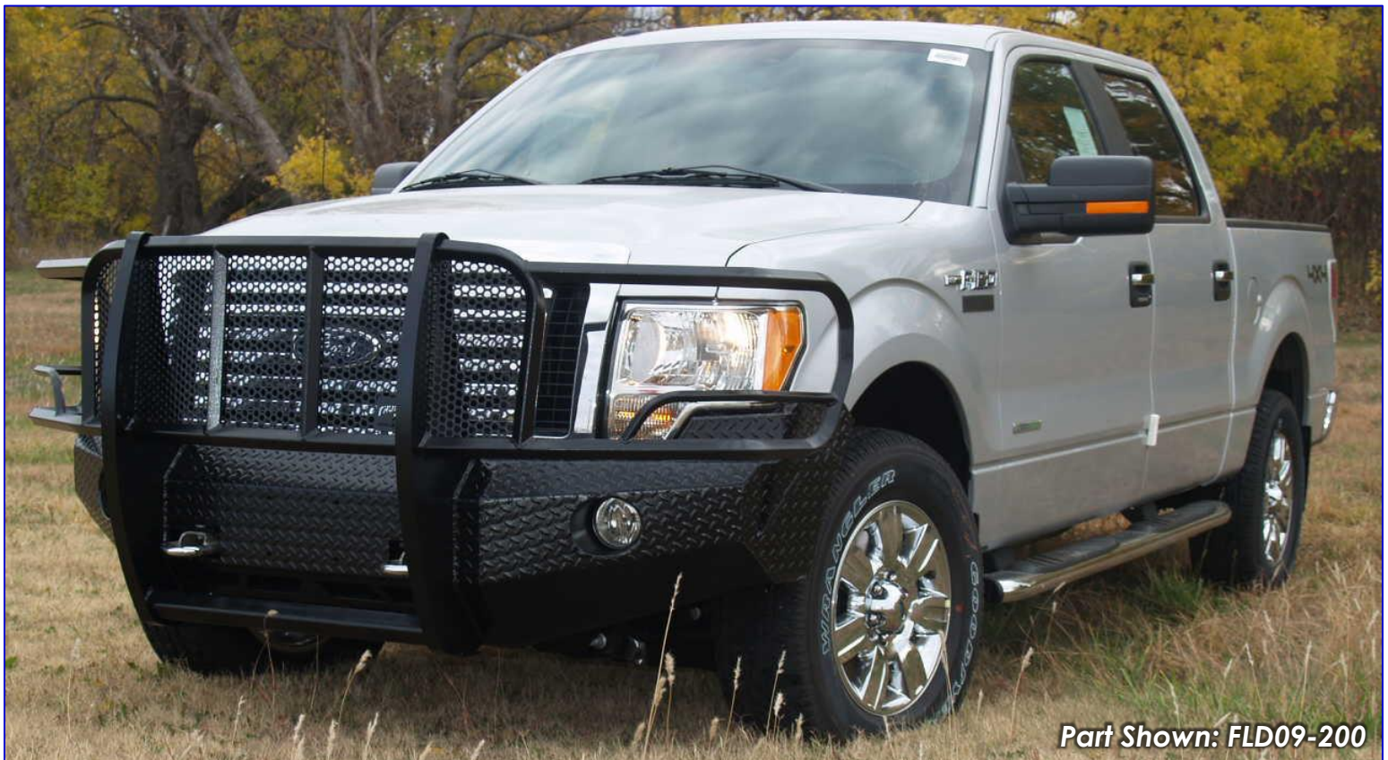
Part Shown: FLD09-200