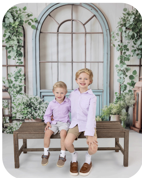
Background will have more greenery added. This is just a sample photo.