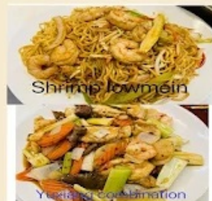
Shrimp Low Mein