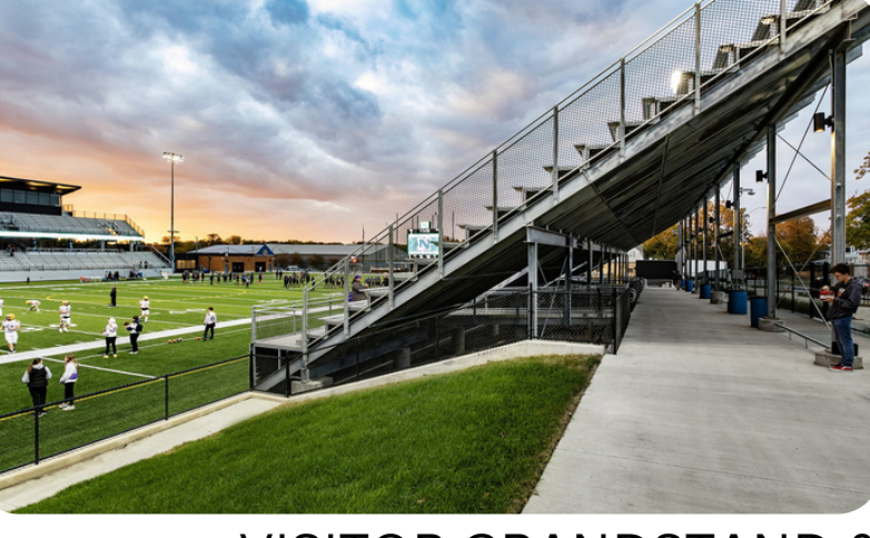
VISITOR GRANDSTAND & CONCOURSE