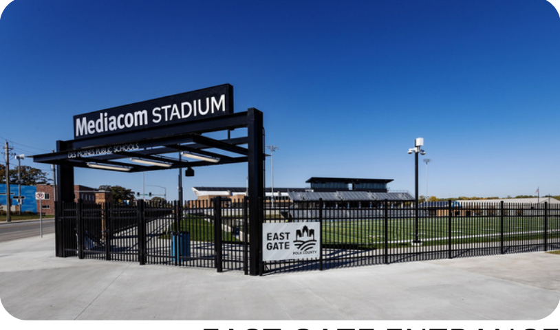
EAST GATE ENTRANCE