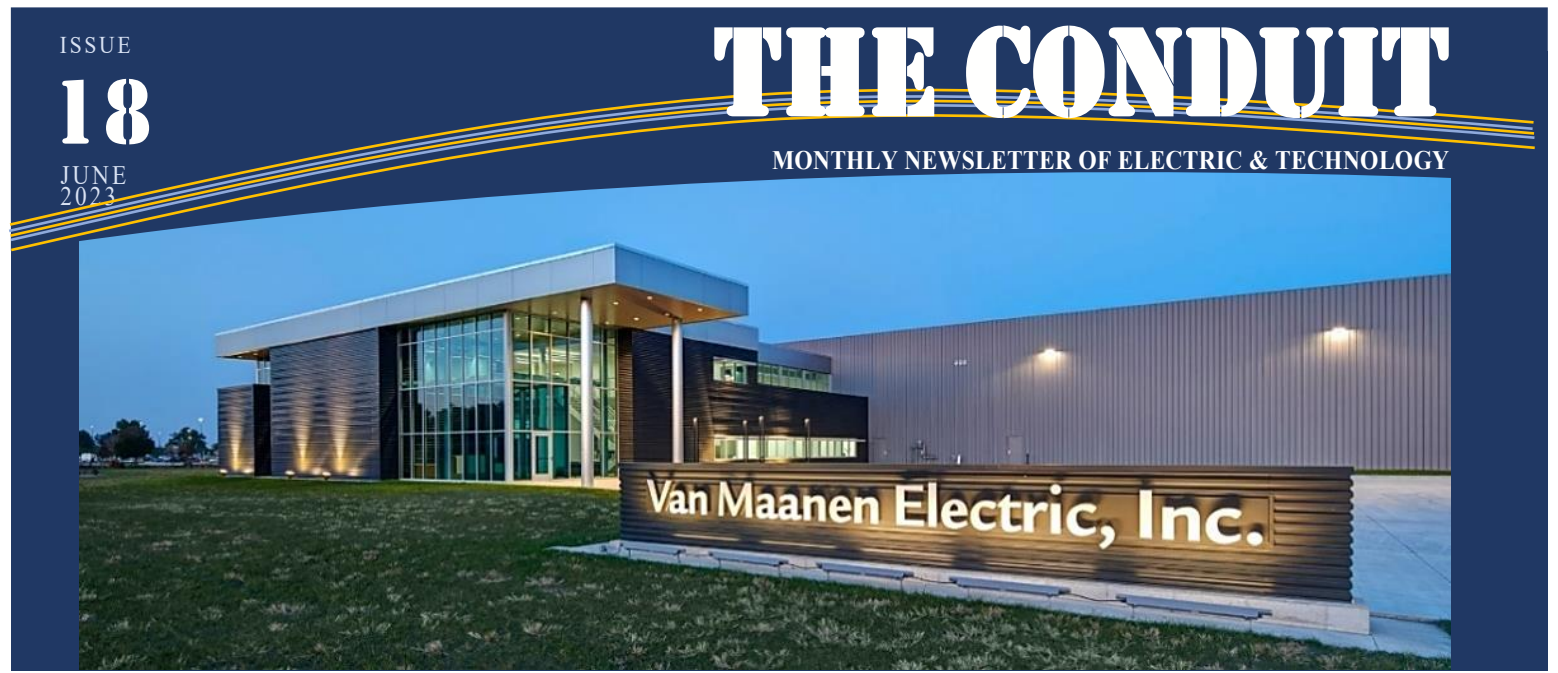
Hello Everyone and Happy 4th of July!