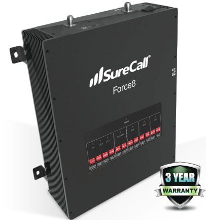
The SureCall Force8 Industrial Amplifier

* Performance and coverage area are dependent upon the strength of cell signal outside of the building and density of structure and materials inside of the building.