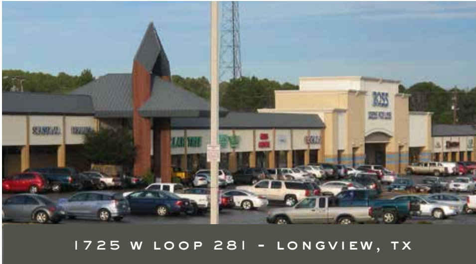
1725 W LOOP 281 - LONGVIEW, TX