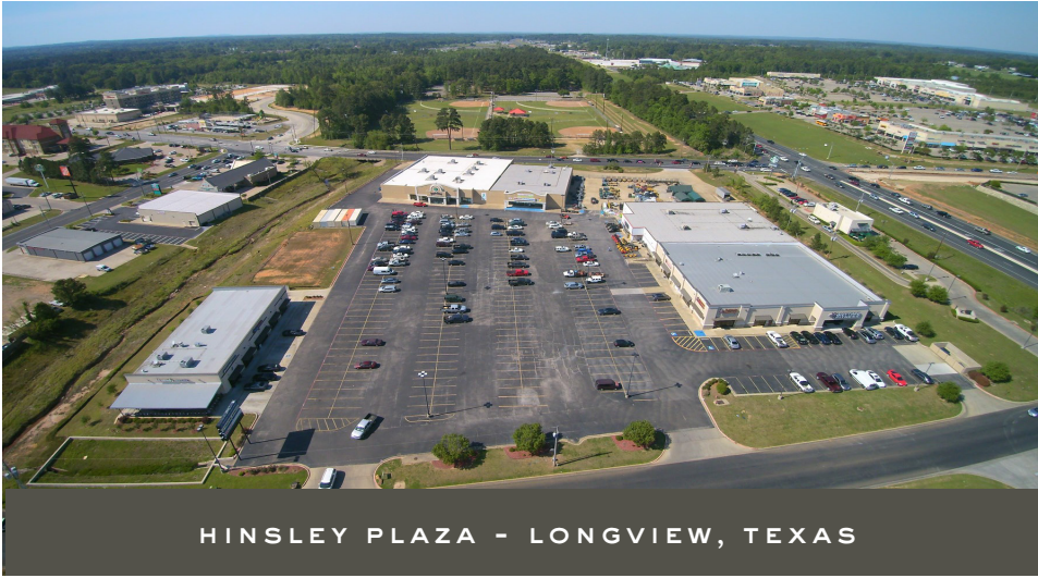
HINSLEY PLAZA - LONGVIEW, TEXAS