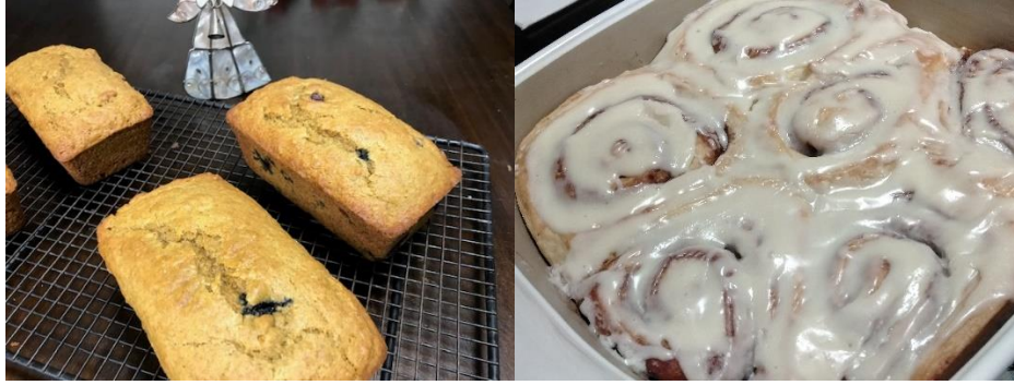
Sweet Potato Blueberry / Traditional Cinnamon Rolls

$55.00 (minimum order 1 dozen per selection) 6-inch loaf; 4-inch Jumbo Muffin