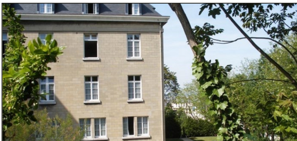
Benedictine guesthouse at Sacré Coeur in Paris

*Daily Itinerary is subject to slight changes due to weather or other unforeseen circumstances.