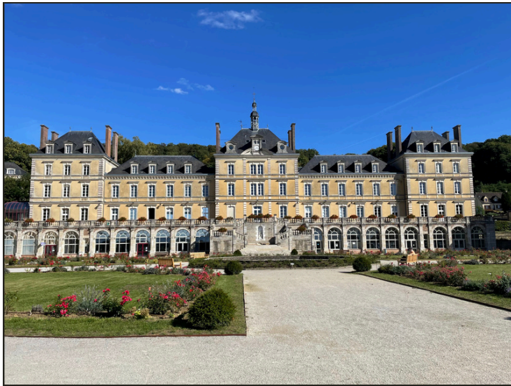
Accommodations and dining at Montligeon

Bienvenue en France! Our minibus will take us straight to Chartres. Here we will discover Notre Dame de Chartres, the cathedral which is considered the greatest example of Gothic architecture and a treasury of stained glass. After an informative tour, we will eat lunch in the main square, then head to our accommodations, one hour west, for a relaxing evening.