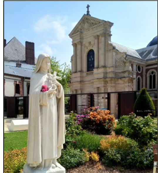
The Carmel at Lisieux