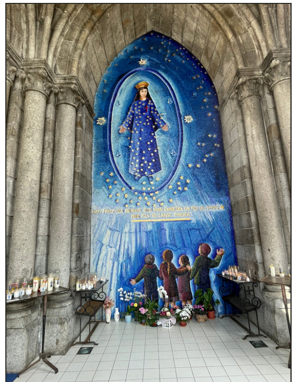
Our Lady of Pontmain

After Mass and breakfast, we will board our coach for the drive to Alençon, birthplace of Saint Thérèse. Here we will tour her childhood home and watch a film about her early years. We will get to know her entire family, especially her parents, through the story of their courtship and marriage. Next we will discover the charming town and visit the cathedral where Louis and Zélie were married and Thérèse was baptized. We will visit the Museum of Alençon Lace to see exquisite examples of "Point Alençon", the style of lace that Zélie made and sold. We will have lunch in town and after a full day we head back to Montligeon for dinner and a quiet evening.