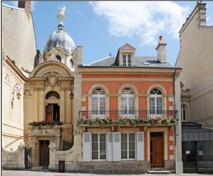
The Martin family home in Alençon