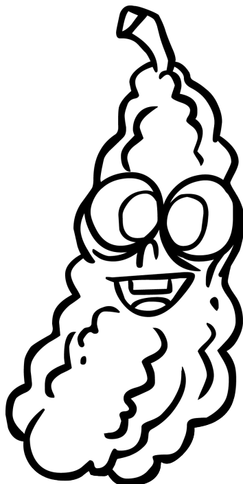
Hi! I am a Squash!