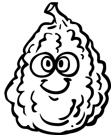
Hi! I am a Gourd!