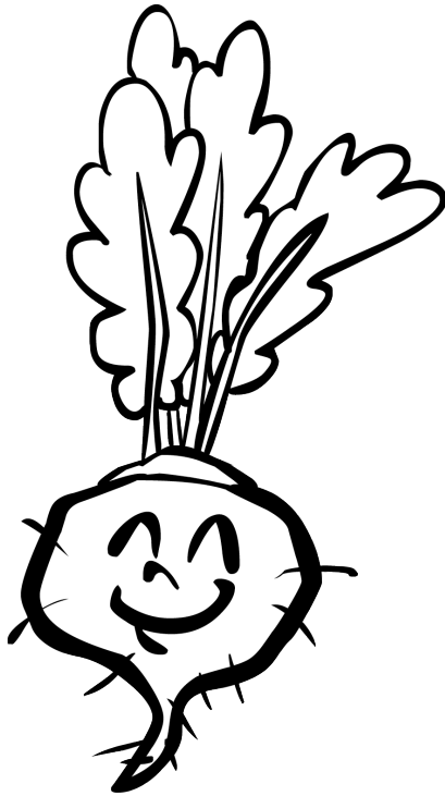
Hi! I am a Radish

Meet these vegetables that are popular in winter! Can you color them and give them a name?