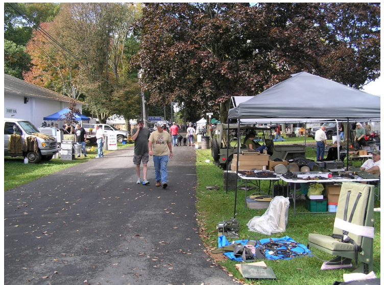
Some early morning shoppers