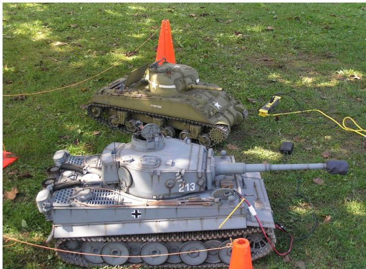
Two large, hand-built, all metal R/C Tanks on display. Running demonstrations were given. Each tank weighs over 100 lbs.