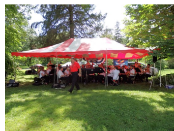
Music was provided by the Nazareth Area Community Band.