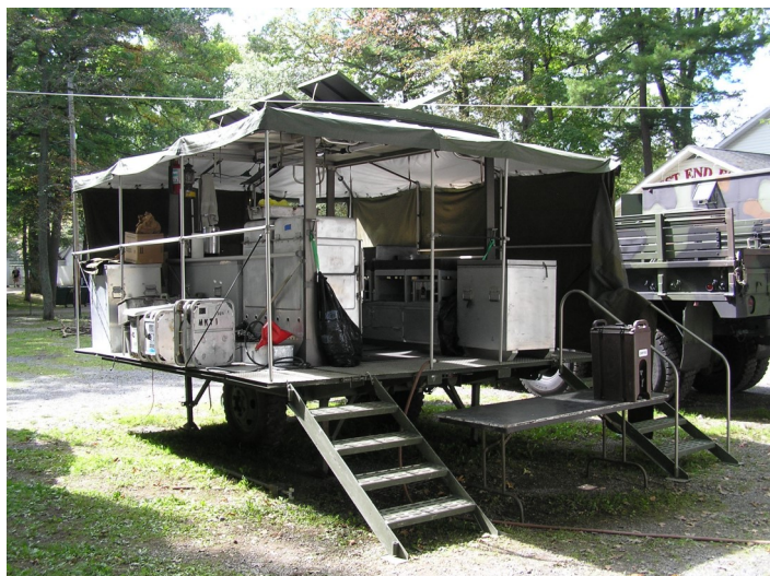
Looking through Foul Weather Walls at Chow Line