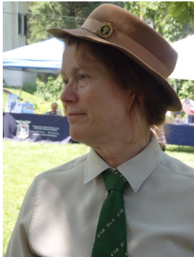
One of the Misses Klein

A Weasel, Halftrack with a quad mount, and a Cushman Scooter were some of the display vehicles.