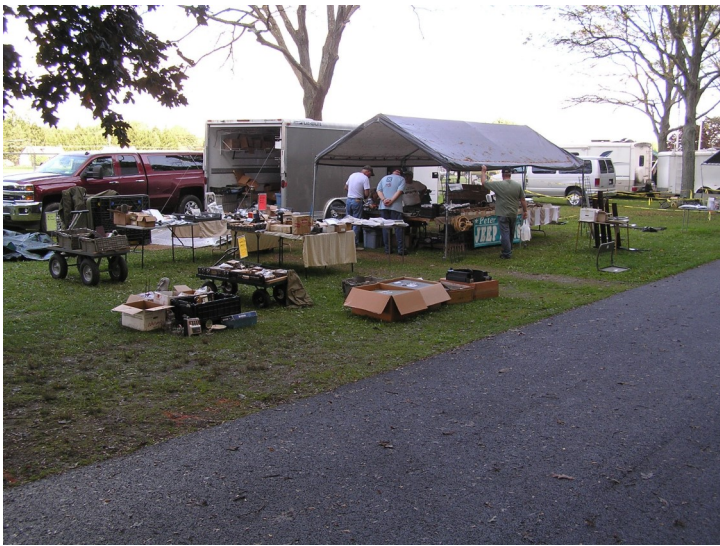
Lots of interesting “stuff” on this table