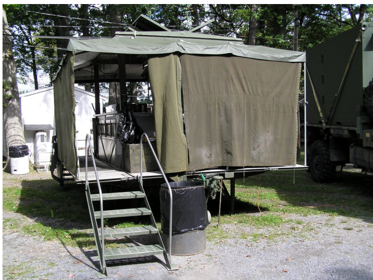
MKT-85 Set Up with Foul Weather Walls