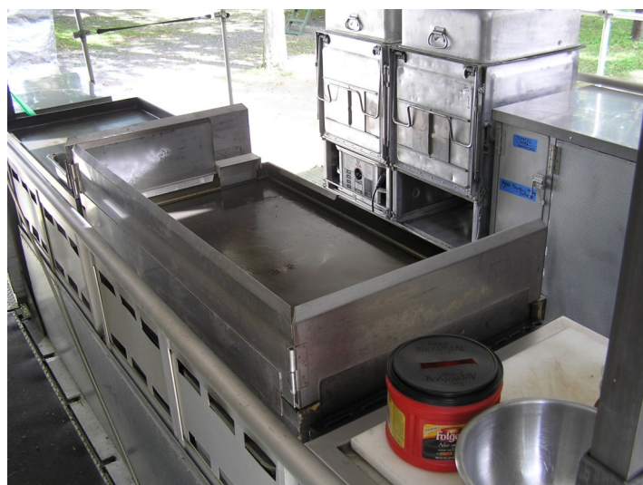
Dual 4" Griddle Setup with M-59 Field Ranges and Prep Counter in background