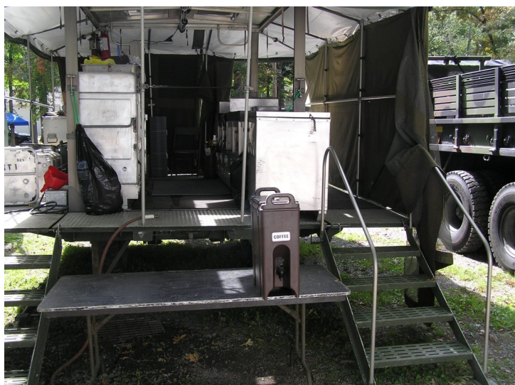
Center Aisle Cook's Work Station, Field Table With 5 Gal. Cambro Beverage Coffee Dispenser