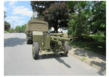
Sven's 105 Howitzer