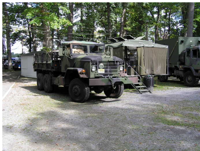
1983 M925 Tow Vehicle with MKT-85 on the right