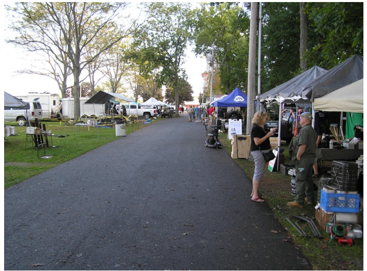
Early view of Swap Meet as vendors move in to set up