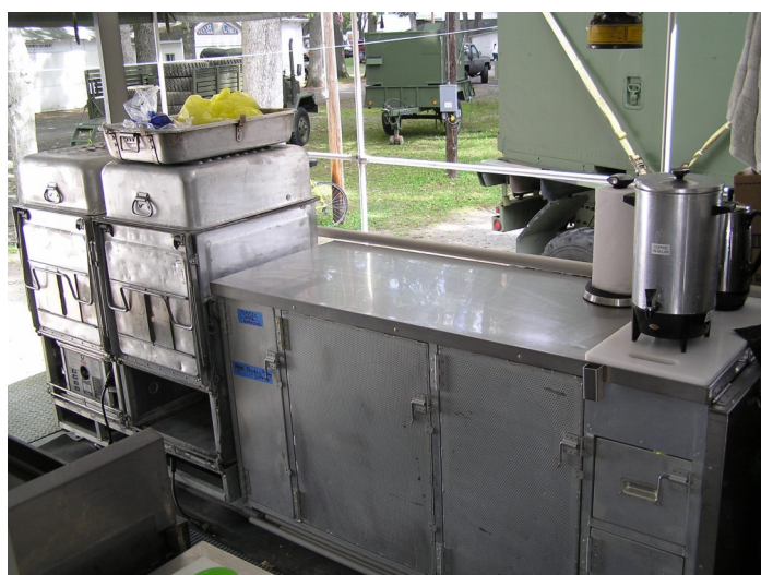
Prep Counter with storage and power cabinet under- neath. 30 cup/12 cup coffee perker and paper towel dispenser ready for action.