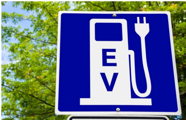
The IBEW is providing input into the rules governing the EV charging buildup.

Through its participation in the rule-making process, the IBEW hopes to persuade officials to adopt a standardized national training program for EV infrastructure installation, the Electric Vehicle Infrastructure Training Program.