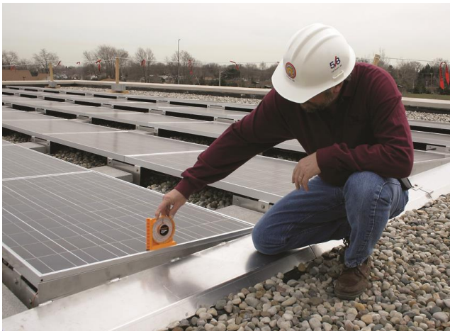
President Biden ordered the federal government to reduce carbon emissions.

"The IBEW applauds President Biden's ambitious plan to put the federal government on the road to sustainability. By ensuring union workers are front and center in its efforts to reduce carbon emissions and modernize our nation's infrastructure, today's executive order proves that it is possible to achieve climate goals while supporting the needs of working families. The 775,000 members of the IBEW stand ready to work with the federal government in its transition to zero-emissions vehicles, zero-emissions buildings, and a cleaner future for our country."