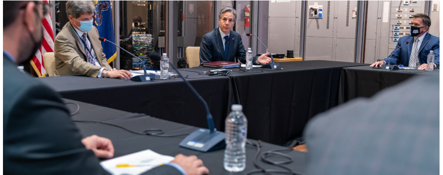
At Pittsburgh Local 5, Secretary of State Antony Blinken holds an unprecedented roundtable with union leaders, pledging that new trade pacts will help American workers.

“Our domestic competitiveness, our national security, and a thriving middle class are mutually reinforcing,” Blinken said . “We want to make sure that we’re engaged in an innovation economy that delivers for workers across the country.”