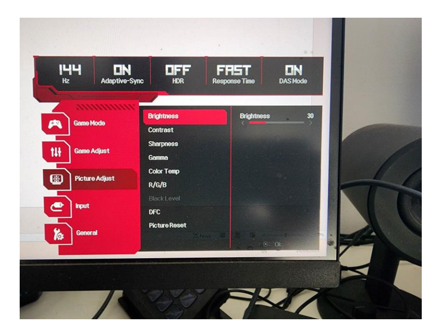
Monitor Settings - Brightness & R/G/B