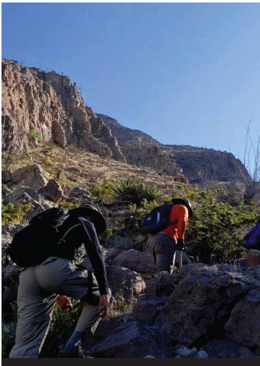
The Outlet Shoppes at El Paso is located at the foot of the Franklin Mountain State Park