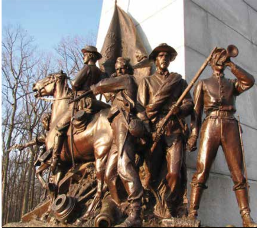
State of Virginia Historical Monument