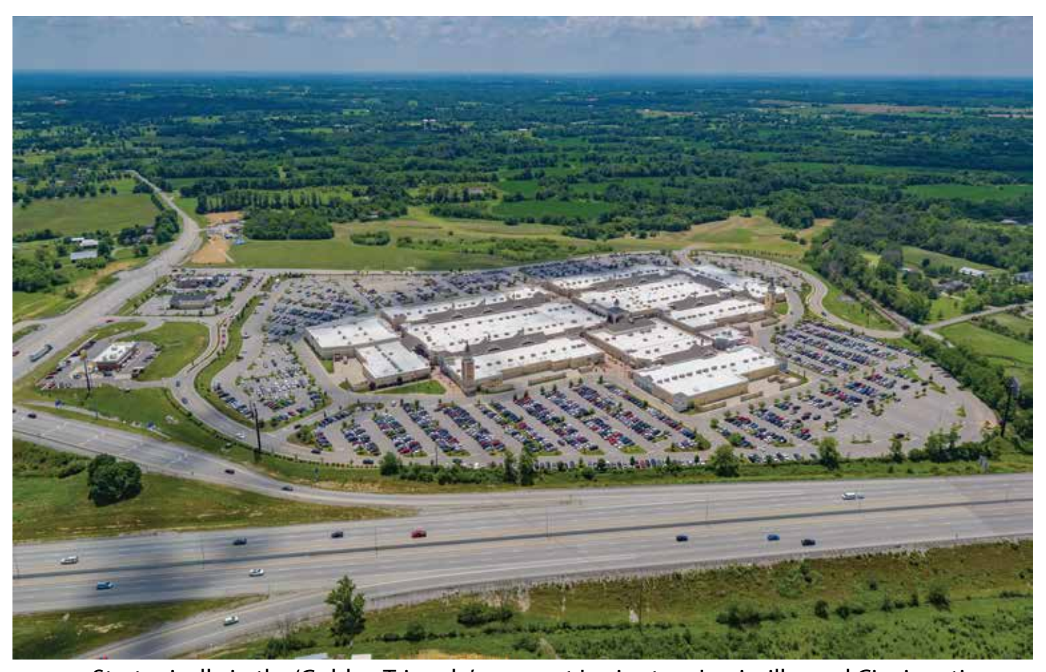
Strategically in the 'Golden Triangle' amongst Lexington, Louisville, and Cincinnati, The Outlet Shoppes of the Bluegrass sits at the crossroads of I-64, I-65, and I-71, and ranks as the 7th largest inland port in the US.

Gross Leasable Area Phase I: 374,686 SF Phase II: 53,390 SF TOTAL: 428,076 SF