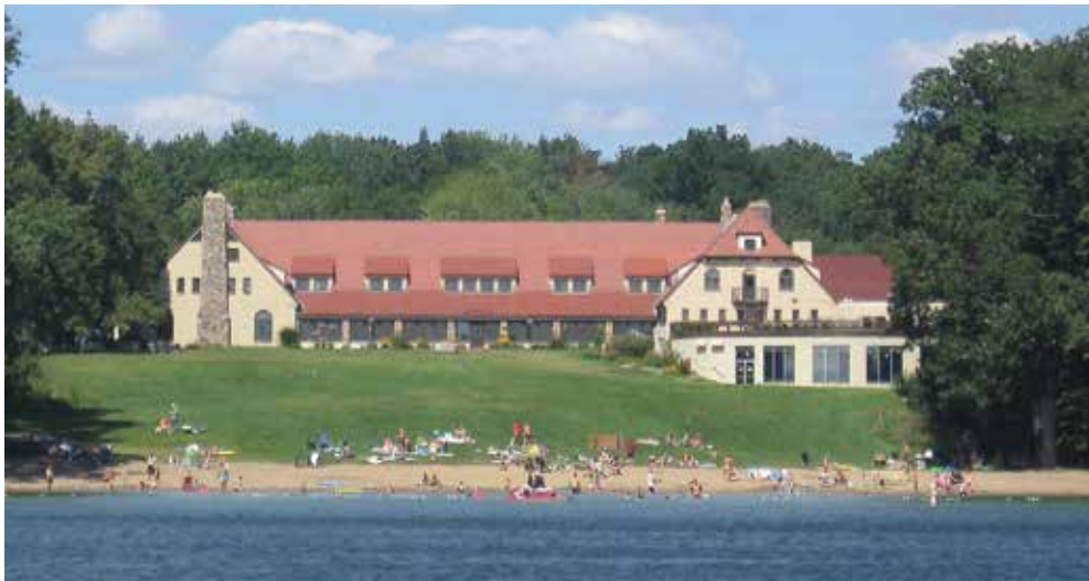
Potawatomi Inn - Pokagon State Park