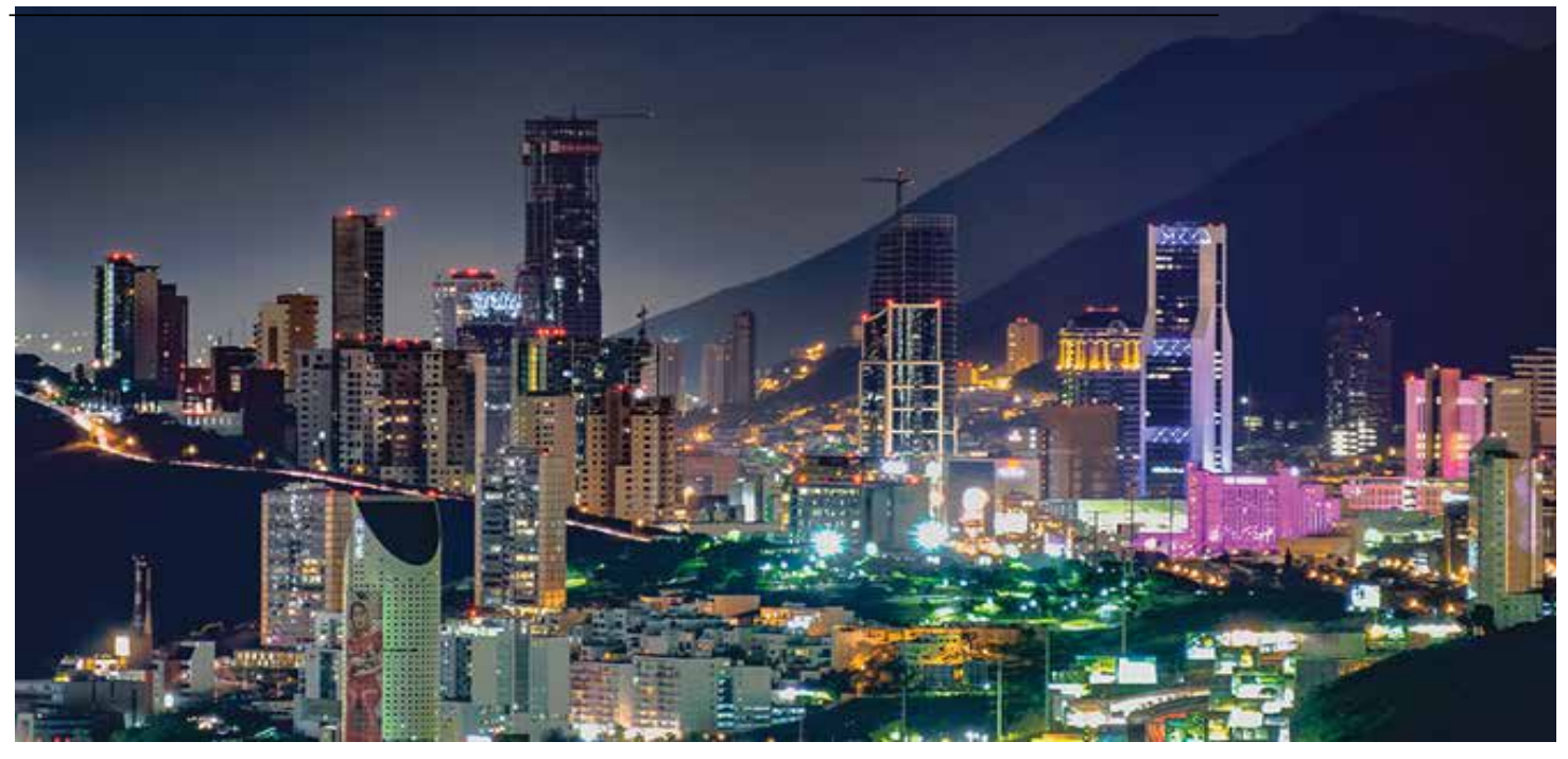
"Monterrey is home to an elite university, a diverse array of well-established multinational companies and a new crop of globally competitive start-ups. Monterrey is the second richest city in Mexico."

Nuevo Leon is the #1 center for foreign direct investment in Mexico with 65% of trade between the US and Mexico passing through the state.