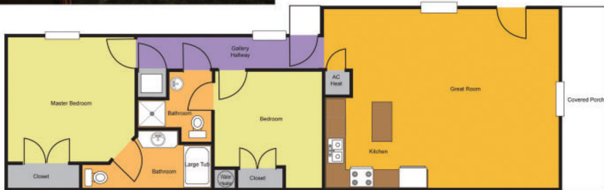
Floor Plan - Flat