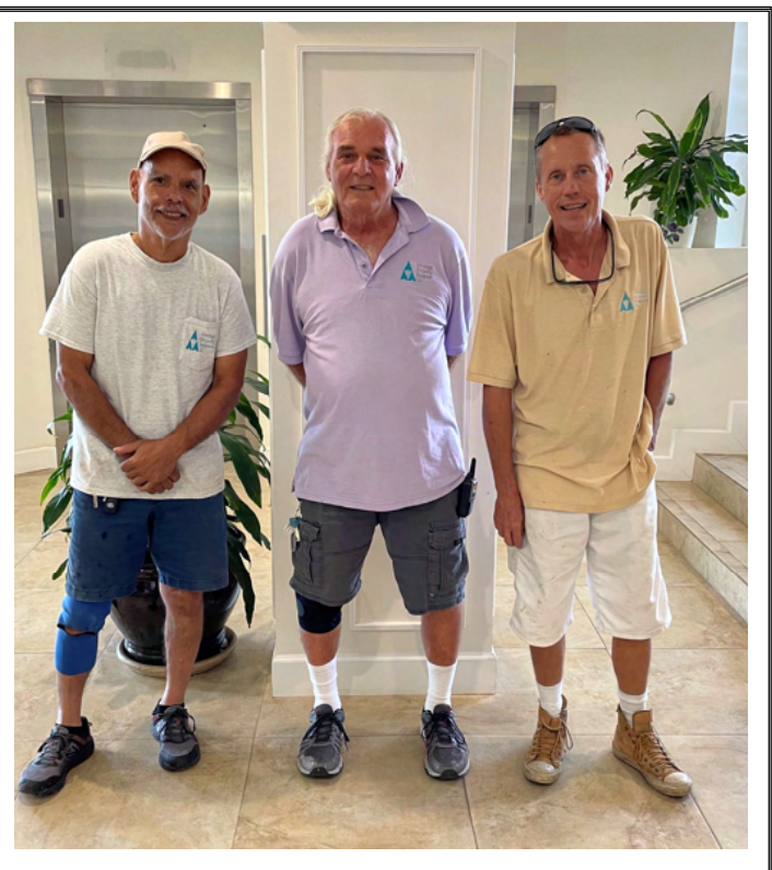
Empress Maintenance Staff