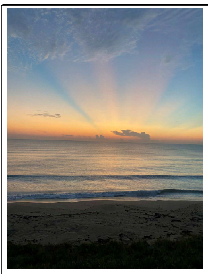
Another beautiful morning at the Empress.....