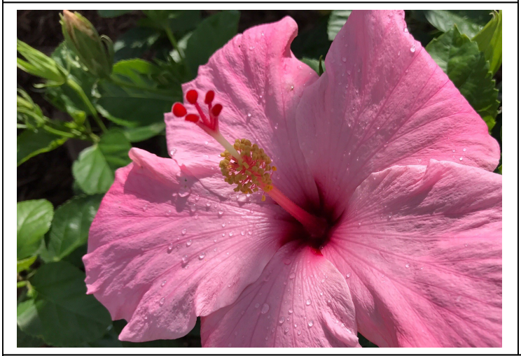
Empress' newly planted hibiscus