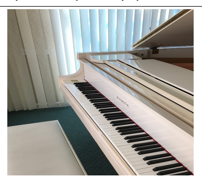
Tuned, oiled and ready to be played

The Financial Statement and Independent Auditor's Report for the year ending December 31, 2016 for Empress is available. If you would like a copy, please either call (772-229-3003) or e-mail (empresscondo@bellsouth.net) the Office to obtain a copy.