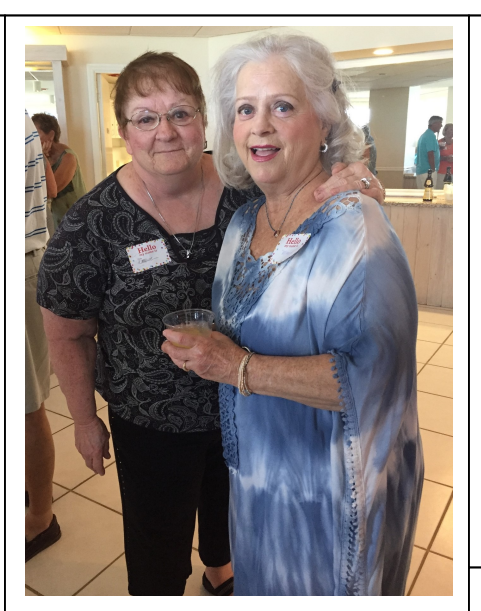
FAREWELL BRUNCH 2017