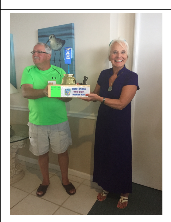
SPLISH SPLASH 2017