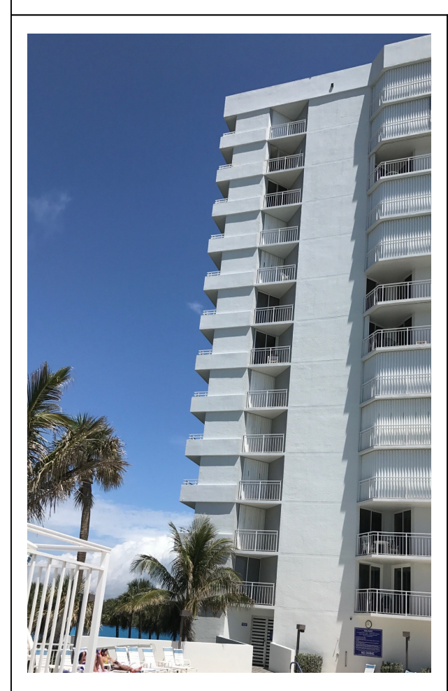
The here and now...