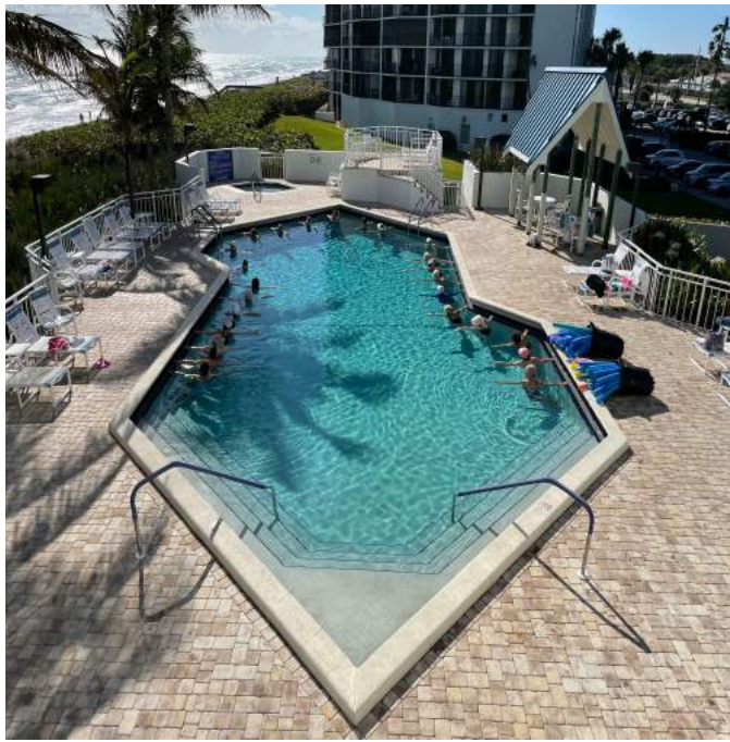
EMPRESS MERMAIDS 2022