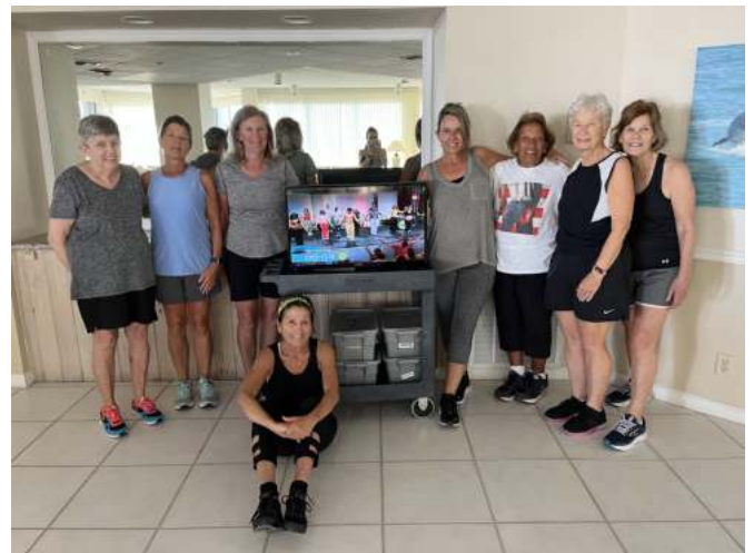
2023 Zumba Crew