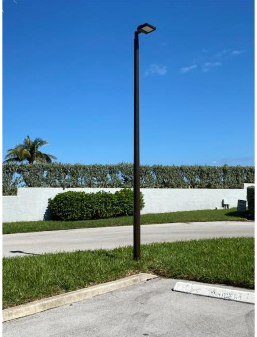
In with the new!