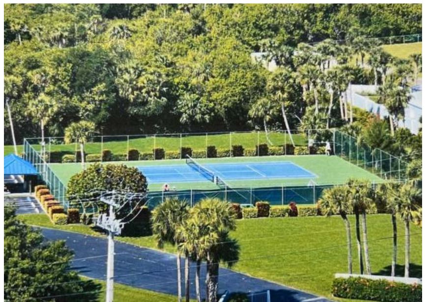
Tennis/Pickleball Courts from above!