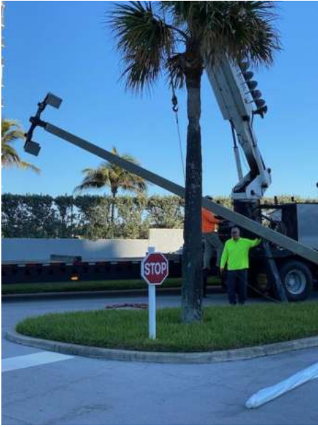
Out with the old....