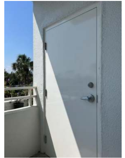
Left: Stairwell Door Center: Social Room Entrance Right: Trash Room Door