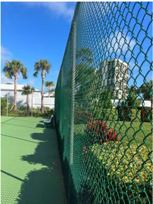
New fence up close!