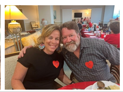
f<sup>t</sup> Empress Bonfire