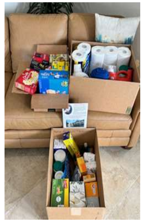
Molly's House Donations

THE LIGHTS OVER THE DUNE WALK WILL BE TURNED OFF DURING THIS TIME.