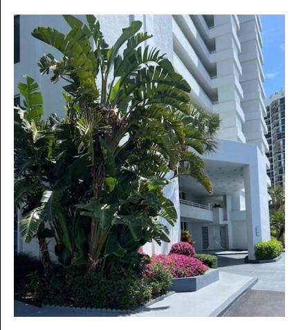
Empress Board of Directors