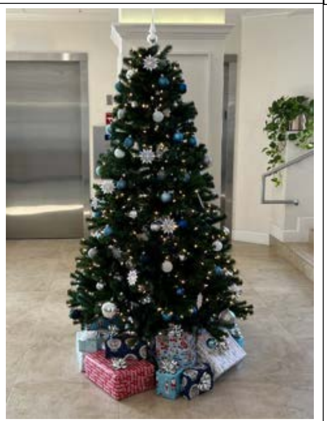
Lobby Christmas Tree 2022

A big shout out of THANKS to our anonymous donor for all the new noodles! Sunny is working us even harder!