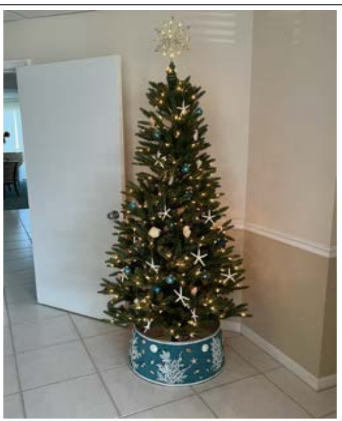
New Addition – Social Room Christmas Tree 2022