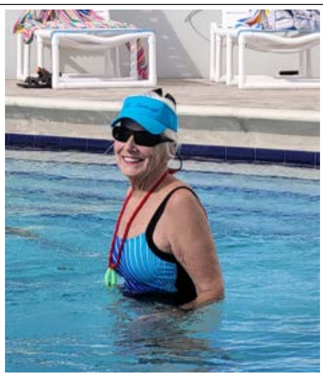
The Empress Mermaid