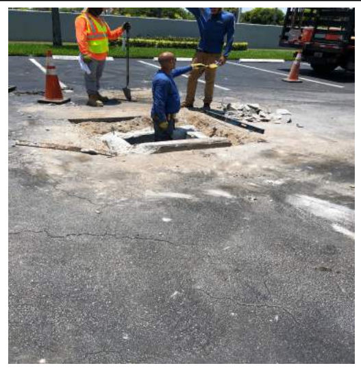
Down the drain...