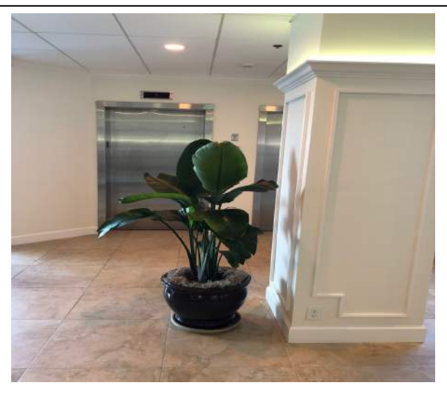
Nothing like a fresh coat of paint!