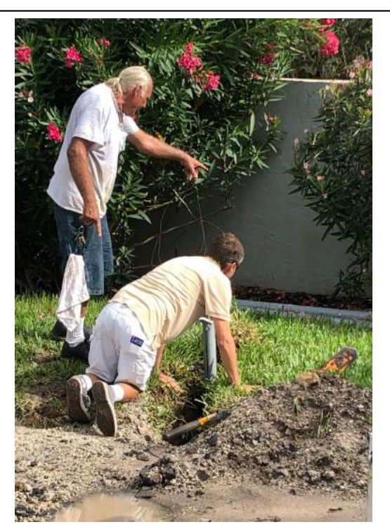
Whatever it takes!