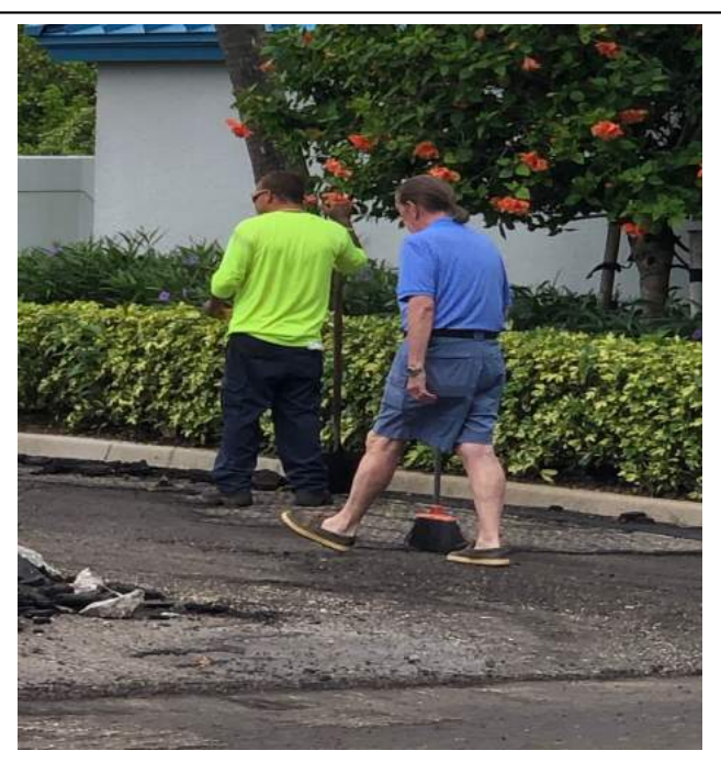
All hands on deck!