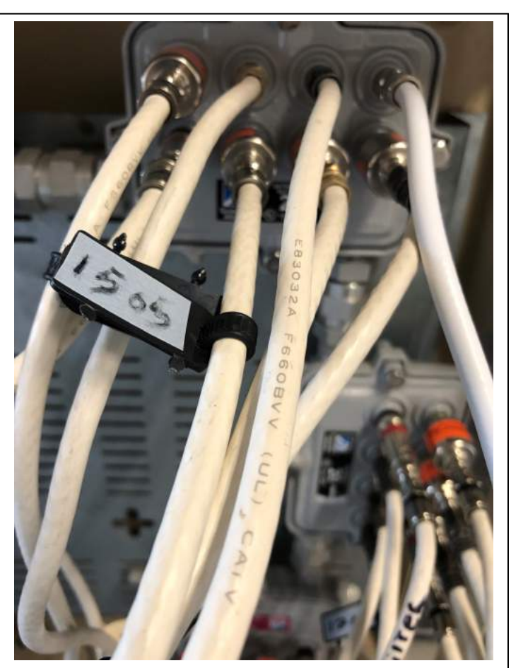
Start of Comcast re-wiring

To find helpful tips on the best A/C settings for seasonal customers please visit www.fpl.com.